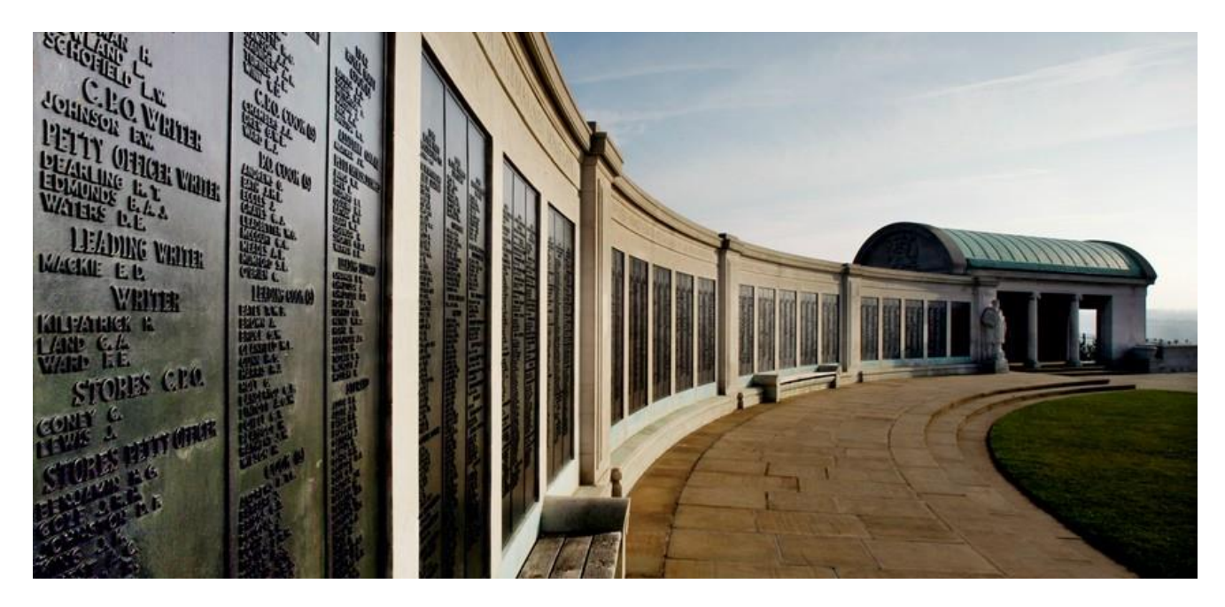
Chatham Naval Memorial