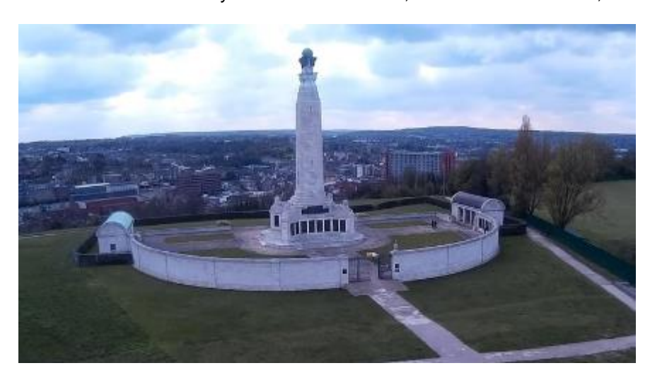
Chatham Naval Memorial

The Chatham Naval Memorial was unveiled by The Prince of Wales, the future Edward VIII, on 26 April 1924.