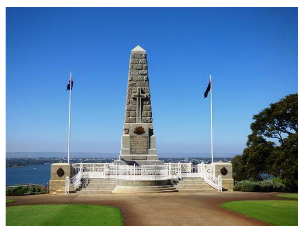
Western Australia State War Memorial Cenotaph, Kings Park (above) & (below) The Crypt with the Roll of Honour names

The heavy concrete foundations are supplemented by heavy brick walls which enclose an inner chamber or crypt. The walls surrounding the crypt are covered with The Roll of Honour; marble tablets which list under their units the names of more than 7,000 members of the services killed in action or as a result of World War One.