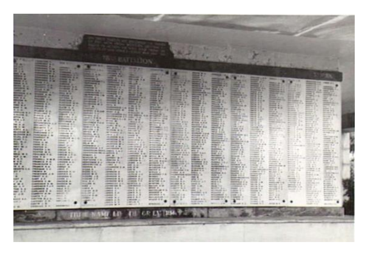
The Roll of Honour of 28th Battalion, A.I.F. at the State War Memorial, King's Park, Perth, Western Australia