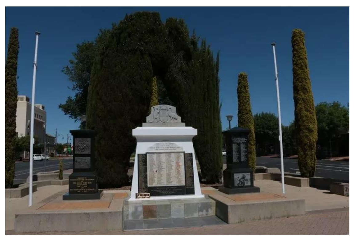
Swan Hill War Memorial