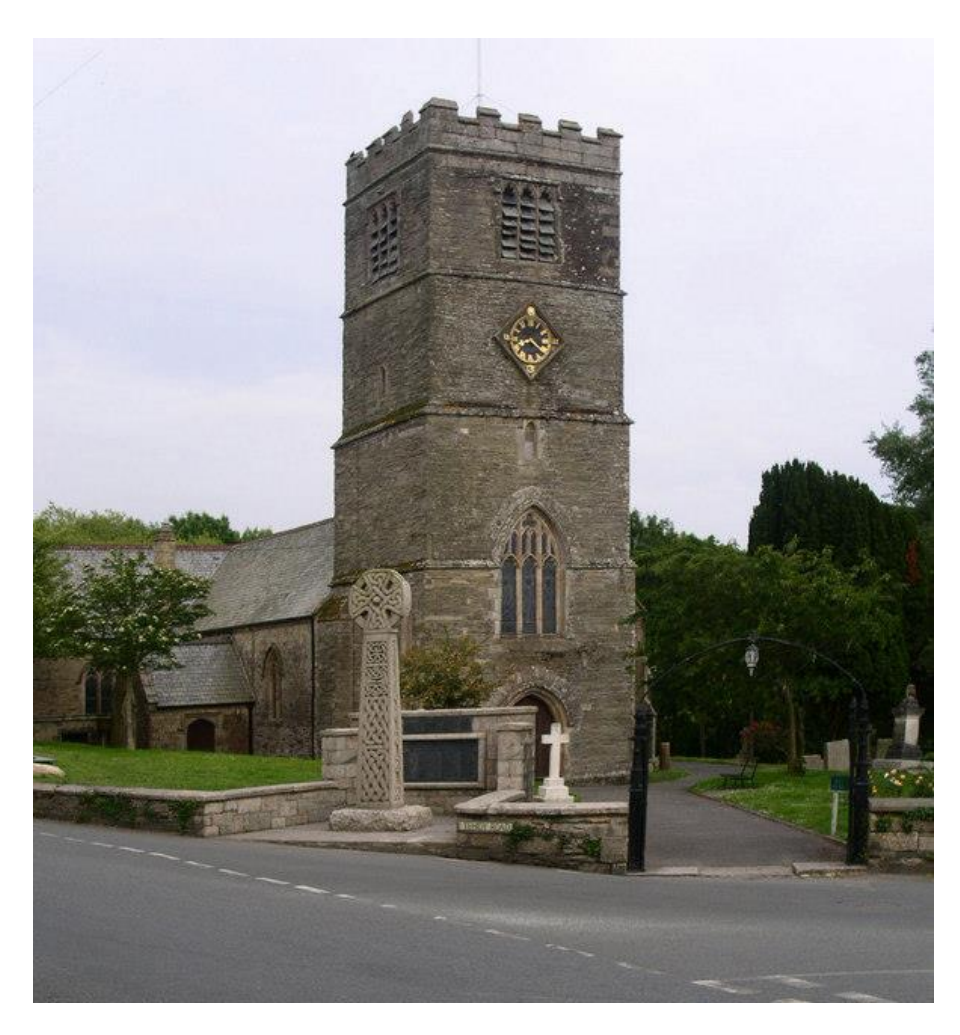
St. Andrew's Church, Tywardreath with War Memorial