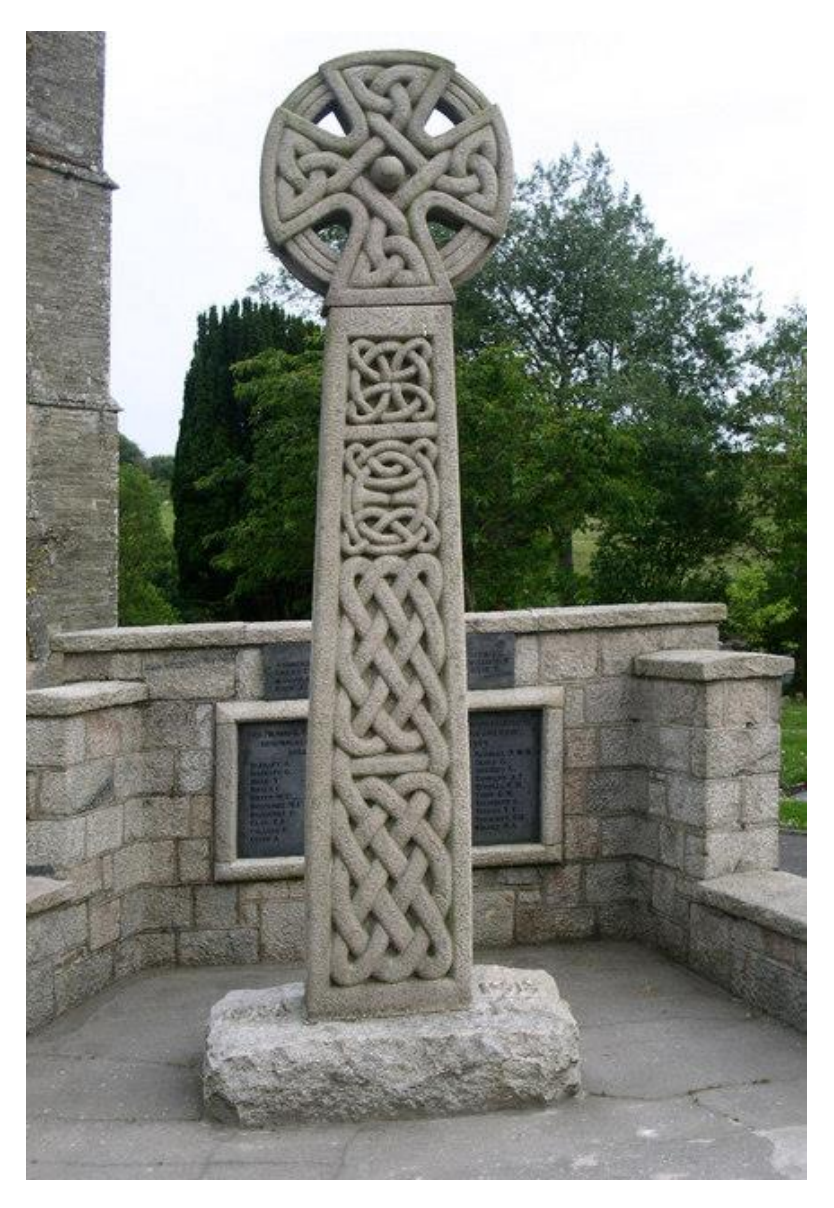
Tywardreath War Memorial