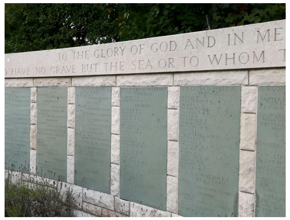
Name Panels behind Cross of Sacrifice