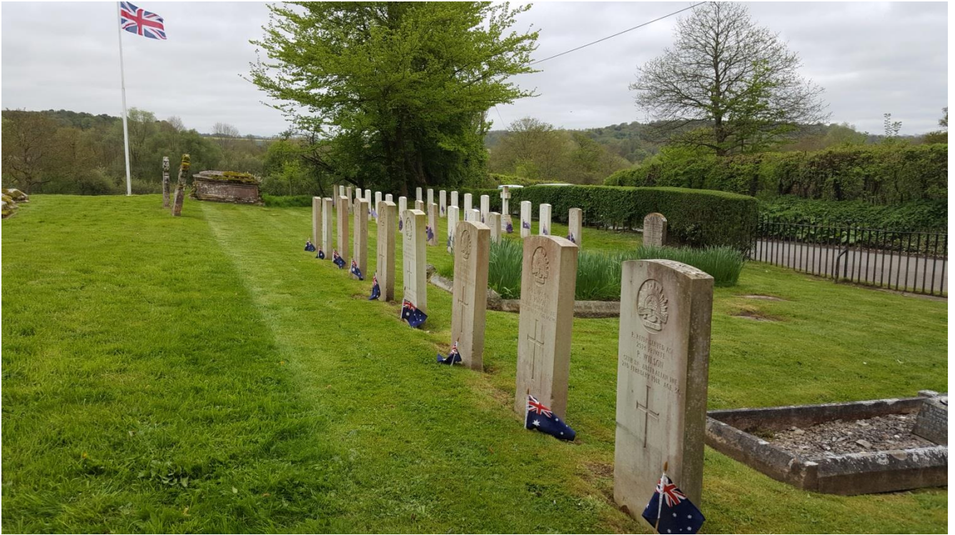
St. Edith's Churchyard, Baverstock