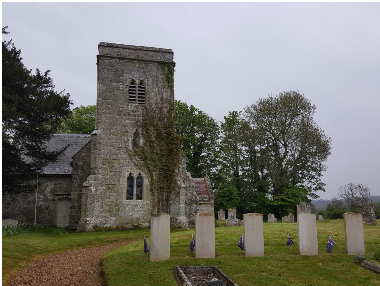
St. Edith's Churchyard, Baverstock

St. Edith's Churchyard, Baverstock contains 32 World War 1 War Graves – 3 London Regiment Graves in the south-west corner & 29 Australian War Graves.