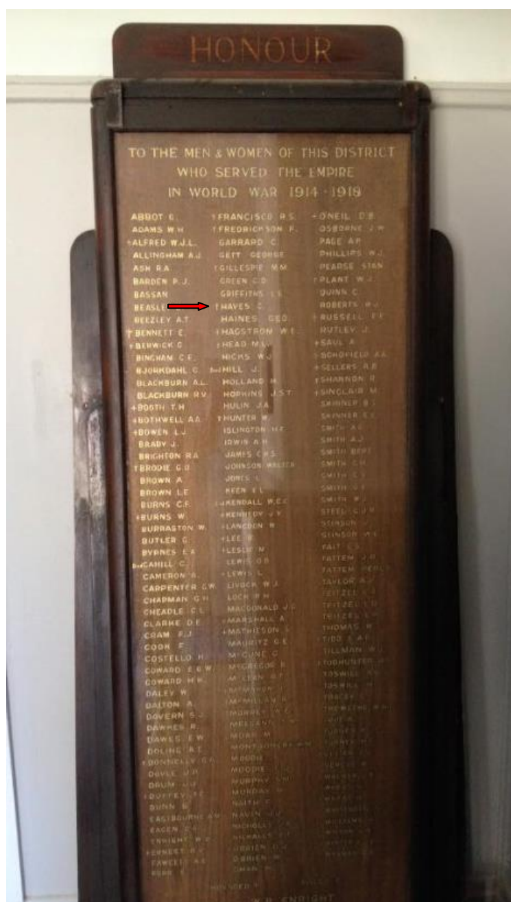
Mungindi District Roll of Honour