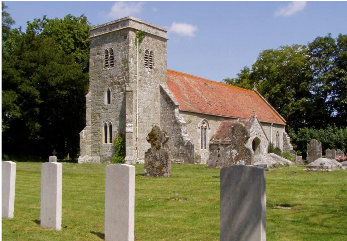
St. Edith's Churchyard, Baverstock, Wiltshire.