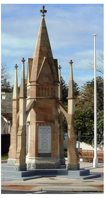
Claremont War Memorial

The Claremont War Memorial, Western Australia does not list individual names.