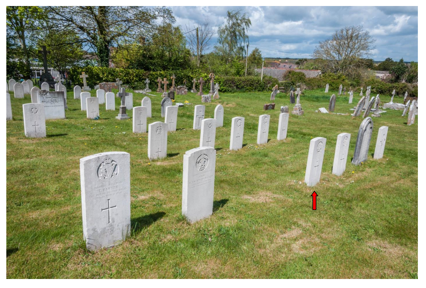
Private E. S. Hayes' Headstone marked with red arrow