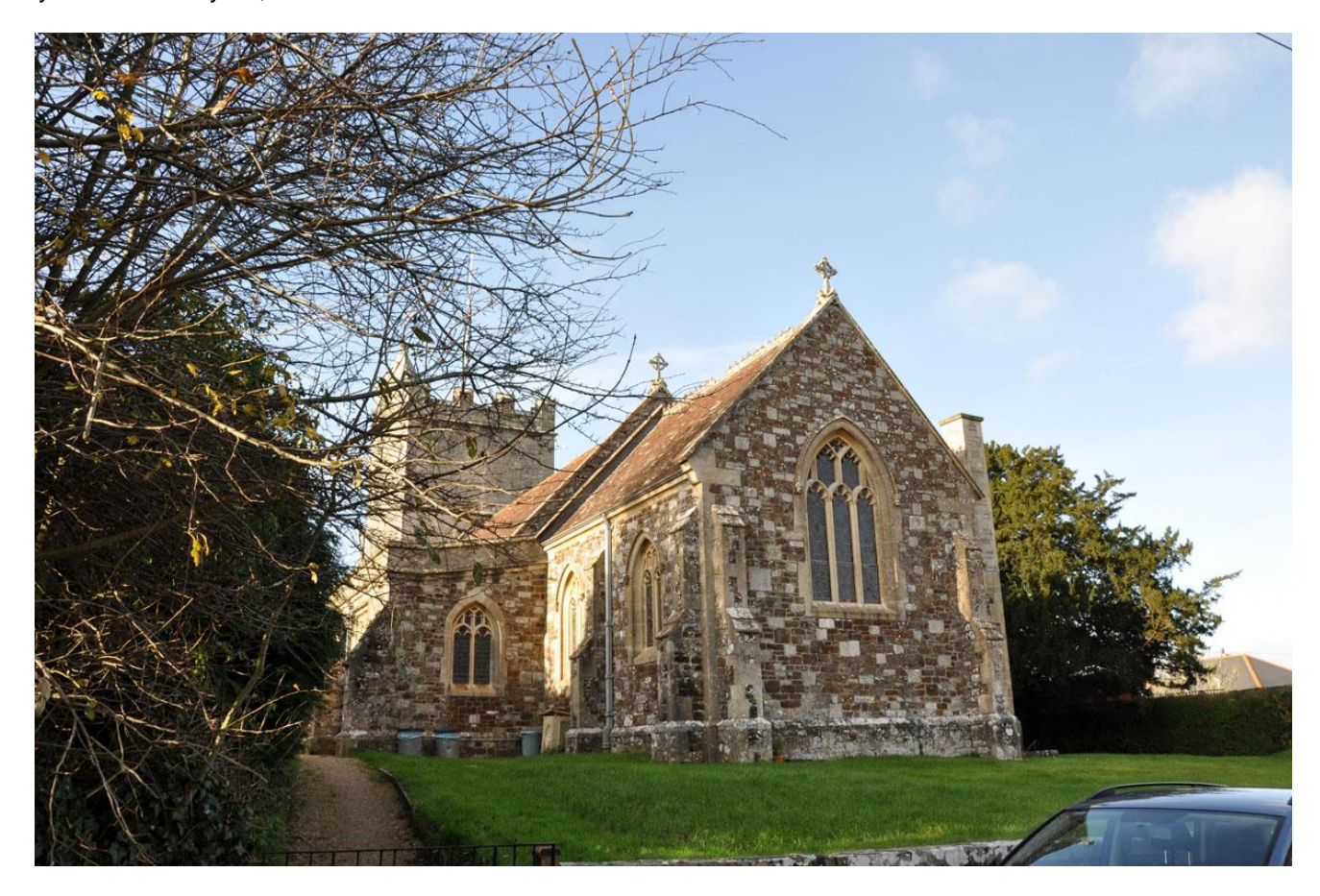
Holy Rood Church, Wool

Holy Rood Churchyard, Wool has 45 Commonwealth War Graves – 22 from World War 1 & 23 from World War 2.