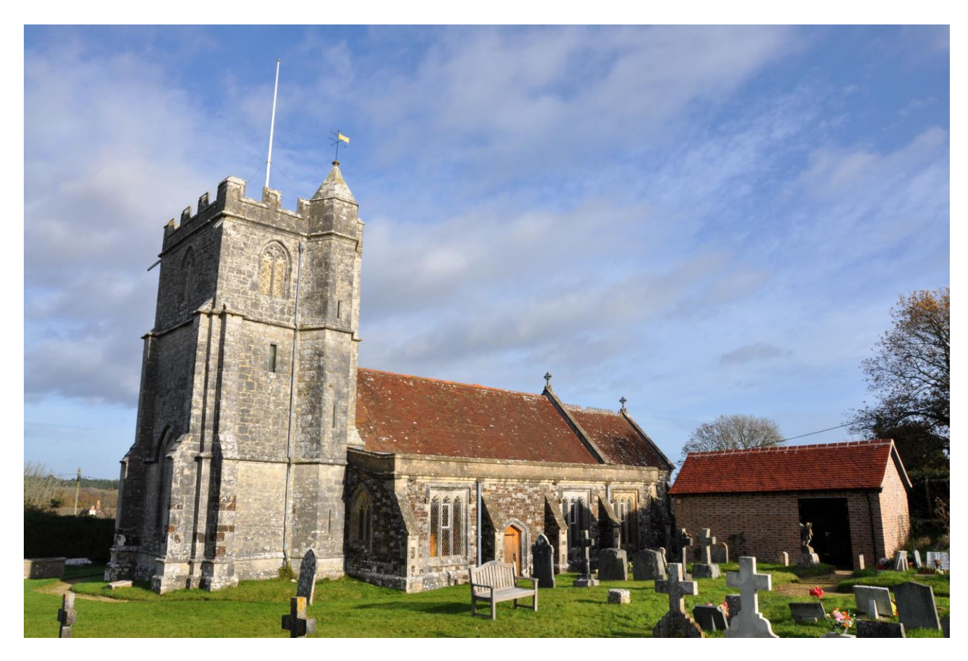
Holy Rood Churchyard, Wool