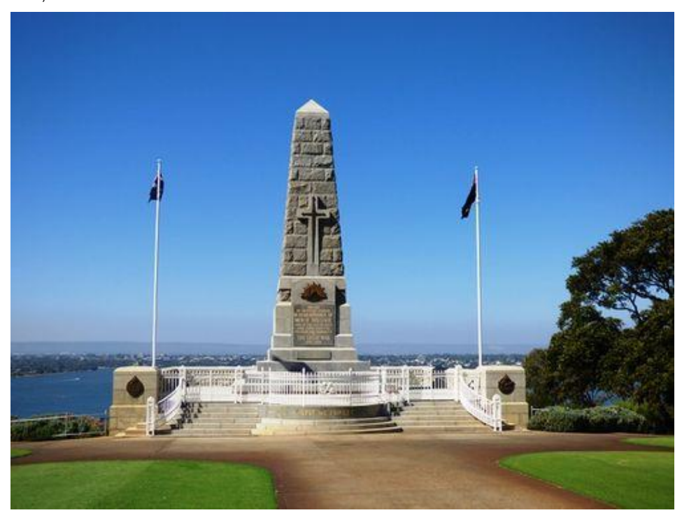
Western Australia State War Memorial Cenotaph, Kings Park

The heavy concrete foundations are supplemented by heavy brick walls which enclose an inner chamber or crypt. The walls surrounding the crypt are covered with The Roll of Honour; marble tablets which list under their units the names of more than 7,000 members of the services killed in action or as a result of World War One.