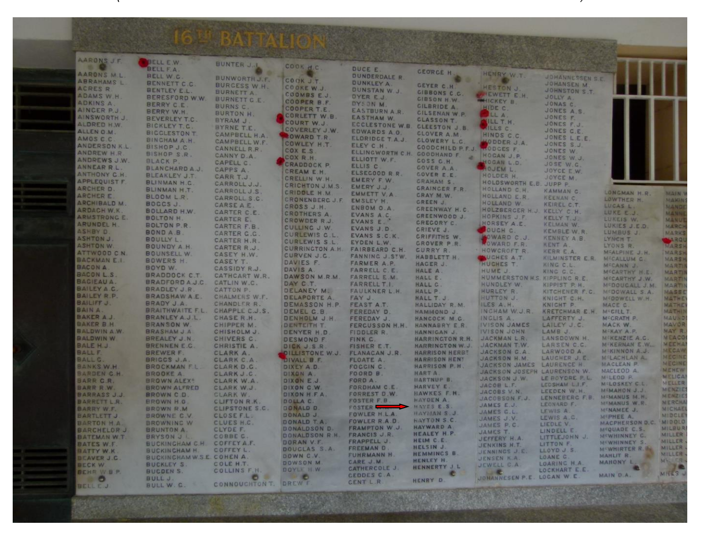
16th Battalion Panel