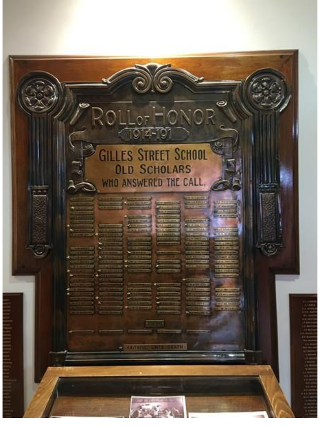
Gilles Street School Roll of Honour