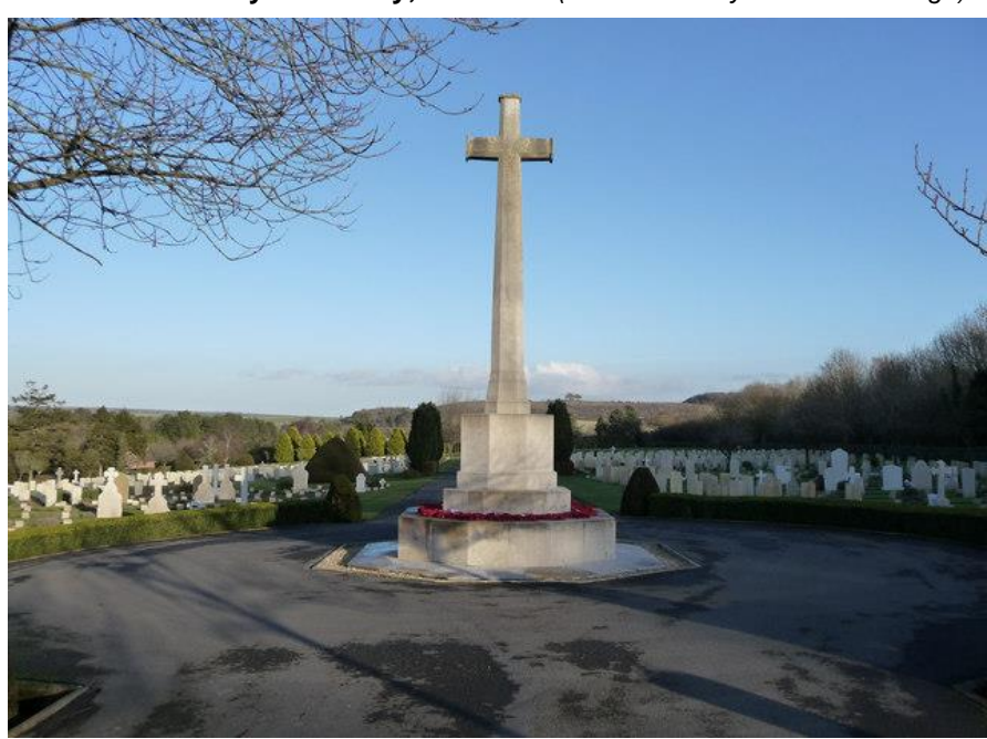
Tidworth Military Cemetery, Wiltshire