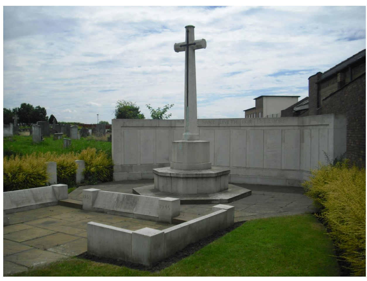
Cross of Sacrifice