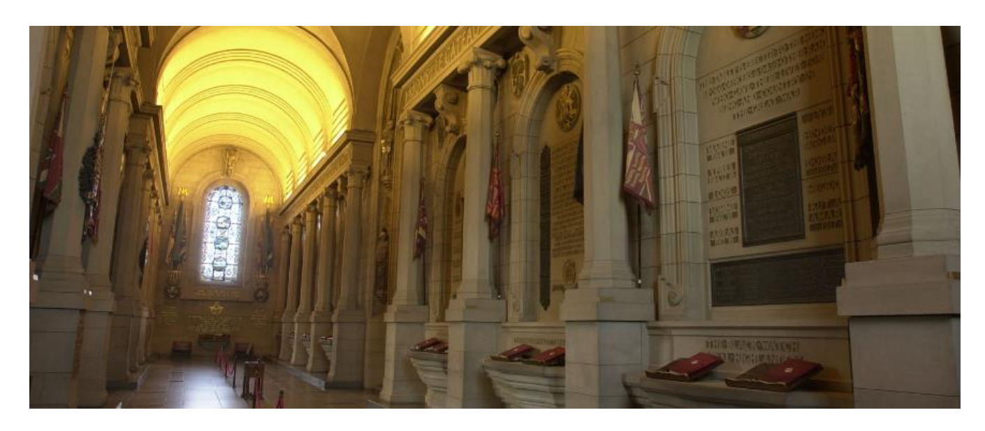
The Hall of Honour & the Roll of Honour books.