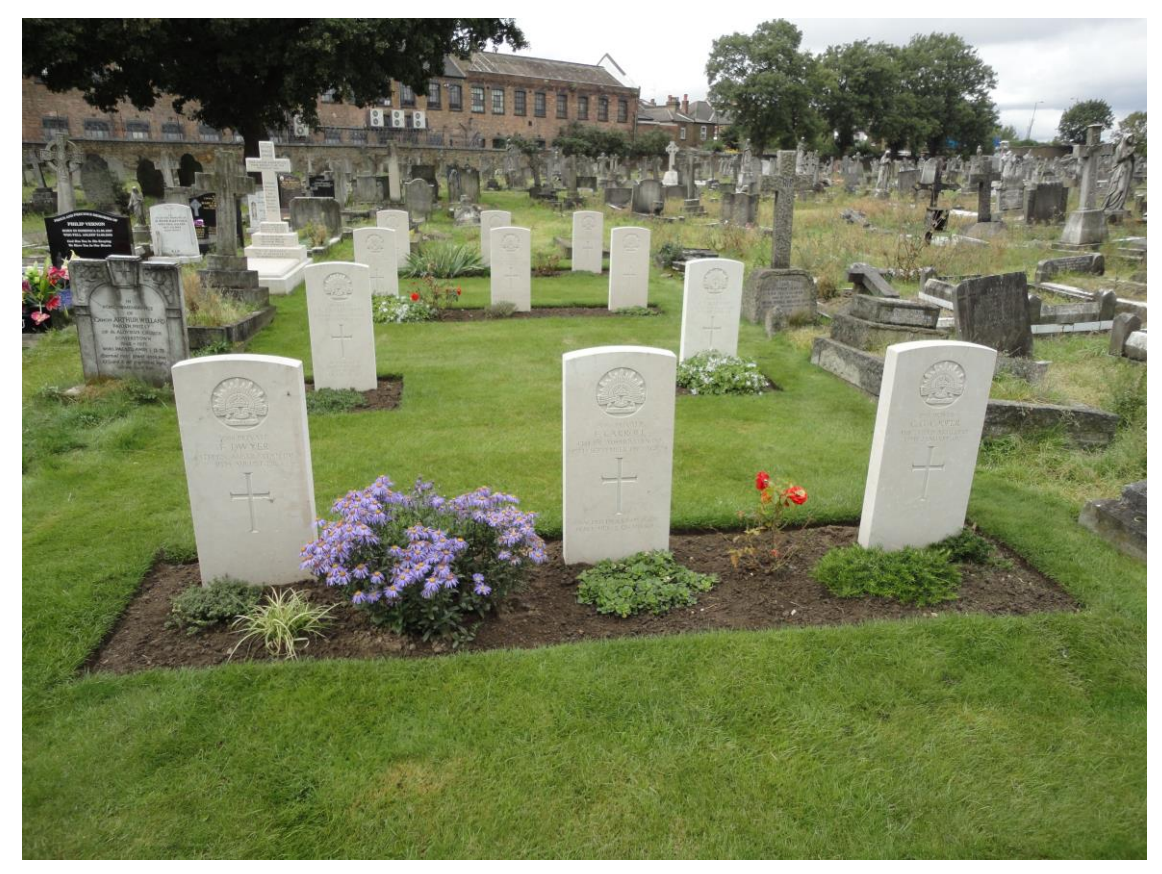
Australian Plot in St. Mary's Roman Catholic Cemetery, Kensal Green