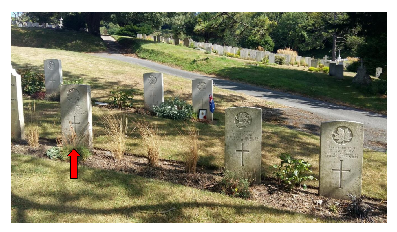
Private Helson marked with arrow