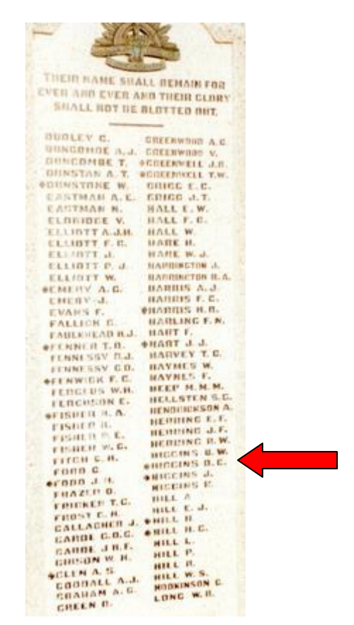
Prince's Park Memorial Gates, Maryborough