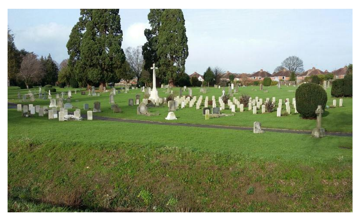
Gloucester Old Cemetery, Gloucestershire

There are 4 Australian War Graves in this Cemetery – three from World War 1 & one from World War 2. (Information & photos from CWGC)