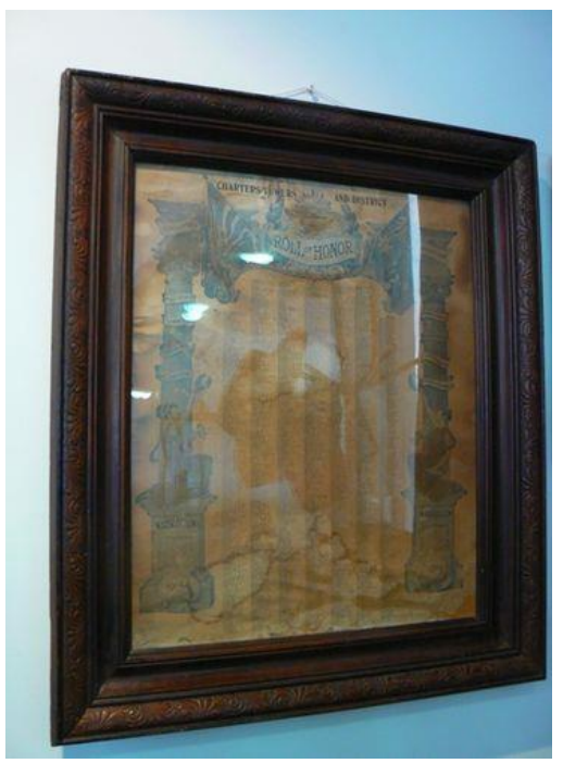
Charters Towers & District Roll of Honour

P. H. Hilder should be included on the Charters Towers & District Roll of Honour, last located at the Charters Towers RSL Club, 8 Prior Street, Charters Towers, Queensland. (Note: the Charters Towers RSL closed in March 2013).