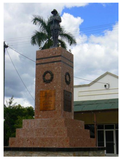
Charters Towers War Memorial

The Charters Towers War Memorial, located in Gill Street, Charters Towers, Queensland does not list individual names.