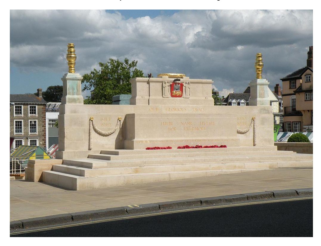
Norwich War Memorial

The Norwich War Memorial located outside City Hall, Norwich, Norfolk, England does not list individual names.