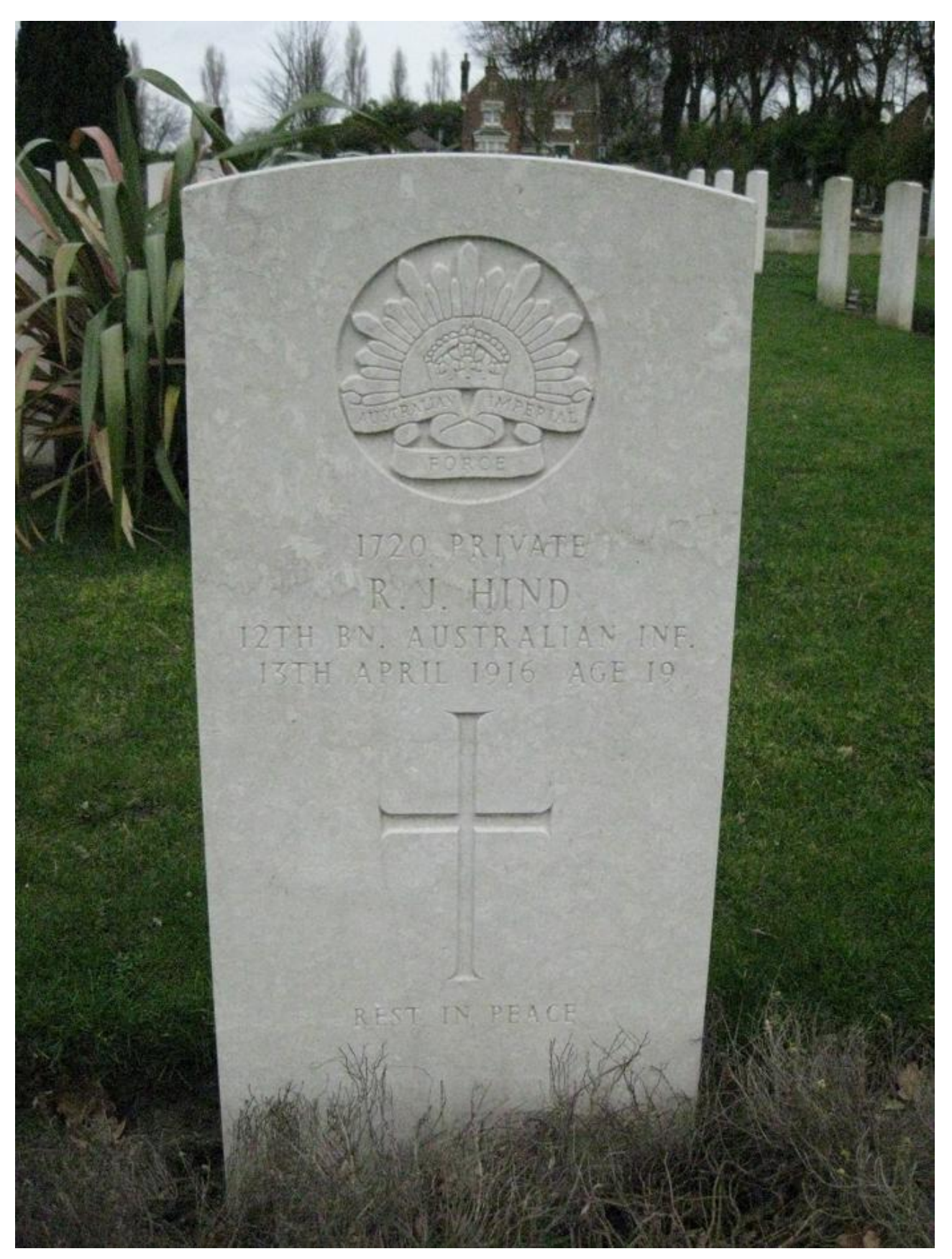
Photo of Private R. J. Hind's Commonwealth War Graves Commission Headstone in Wandsworth (Earlsfield) Cemetery, London, England.