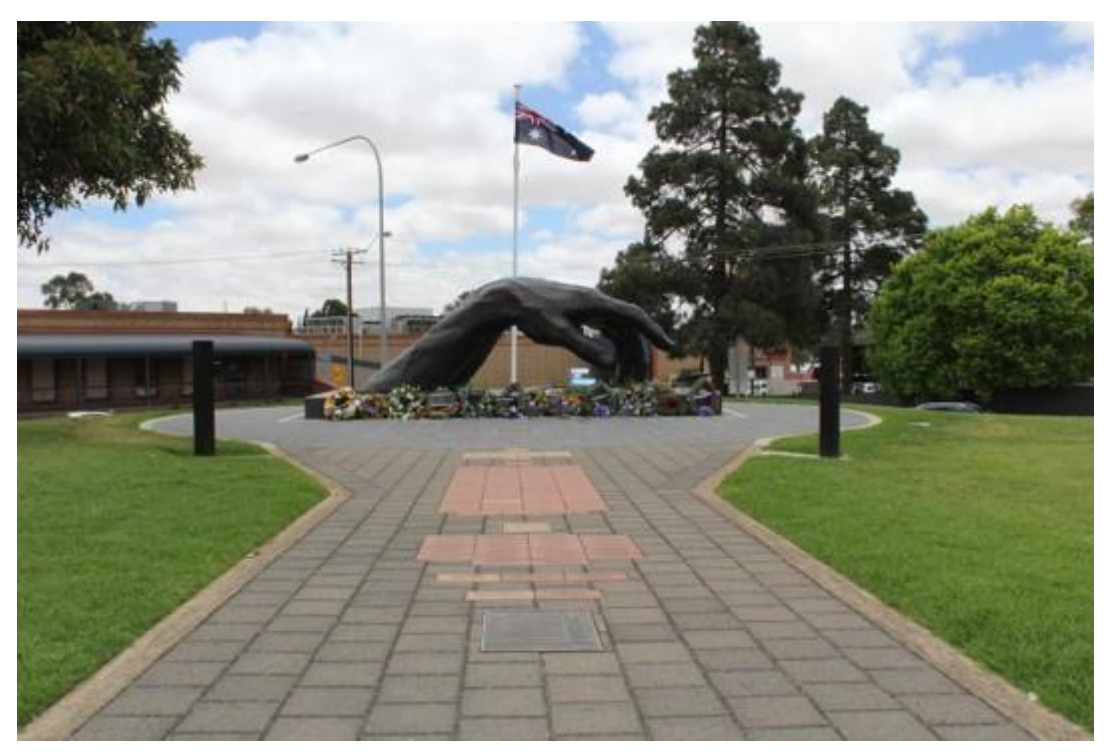
Pioneer Park War Memorial