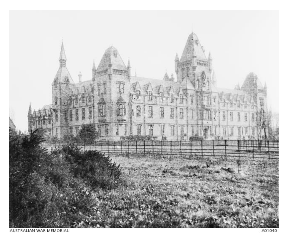
3rd London General Hospital, Wandsworth