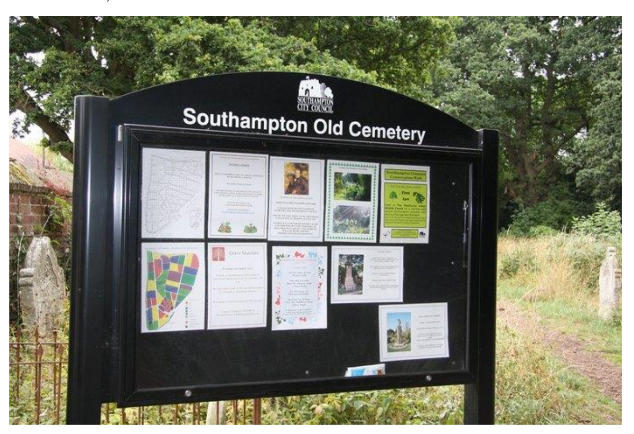
Southampton Old Cemetery