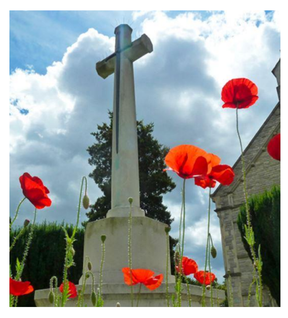
Cross of Sacrifice