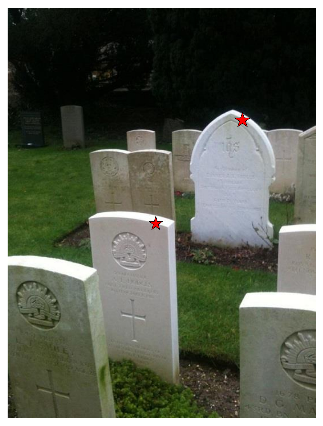
Gunner Hodges' 2 Headstones marked with star