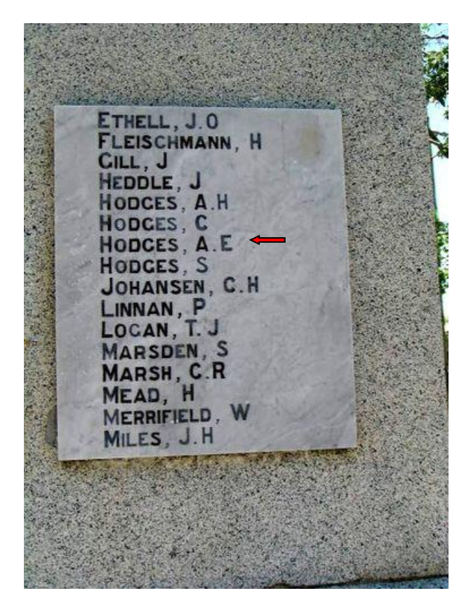
Laidley War Memorial