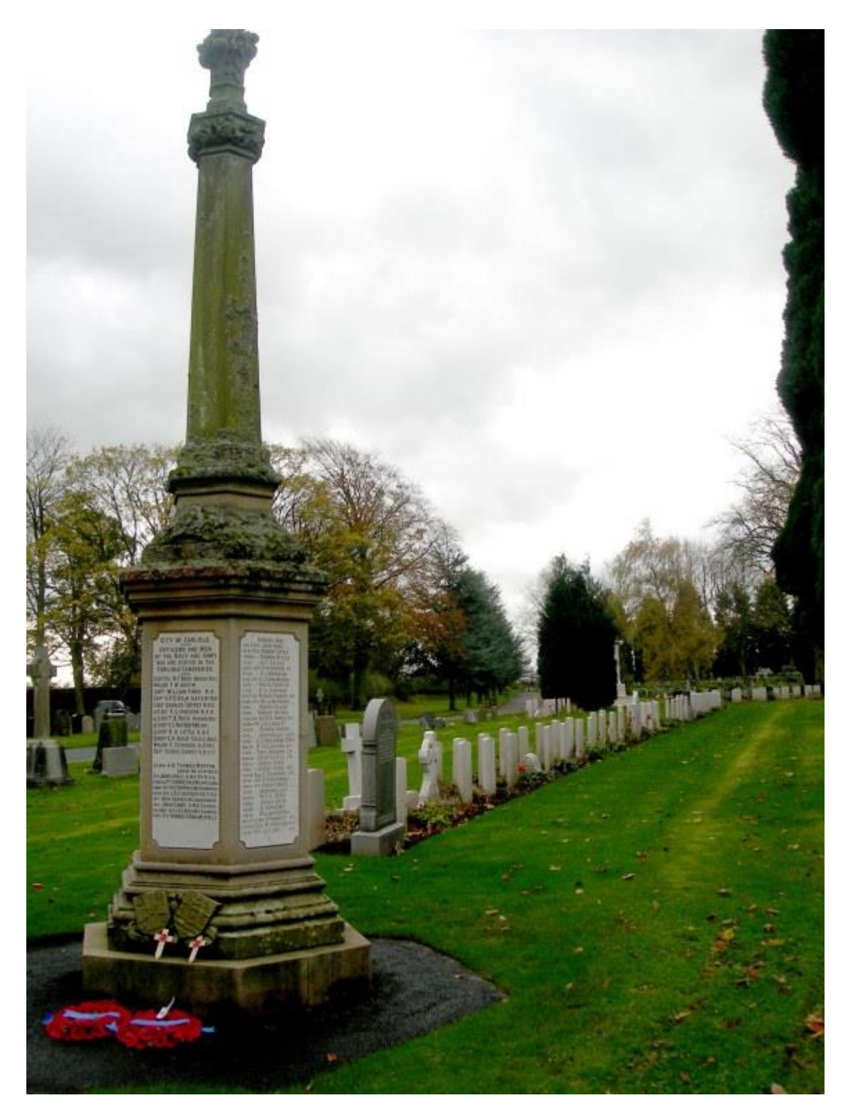
First World War Memorial, located in Dalston Road Cemetery, Carlisle