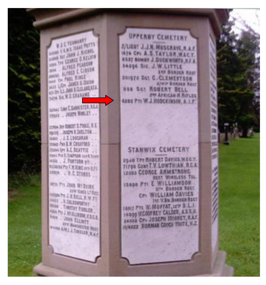
First World War Memorial to all Men & Officers buried in Carlisle Cemeteries - located in Dalston Road Cemetery, Carlisle