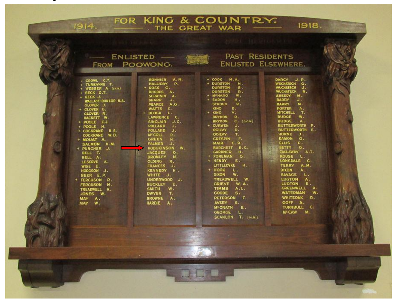
Poowong Honour Roll