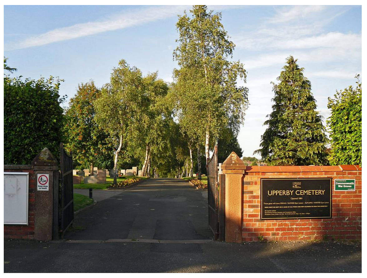
Upperby Cemetery, Carlisle

Upperby Cemetery, Carlisle contains 25 Commonwealth War Graves – 9 from World War 1 and 16 from World War 2.