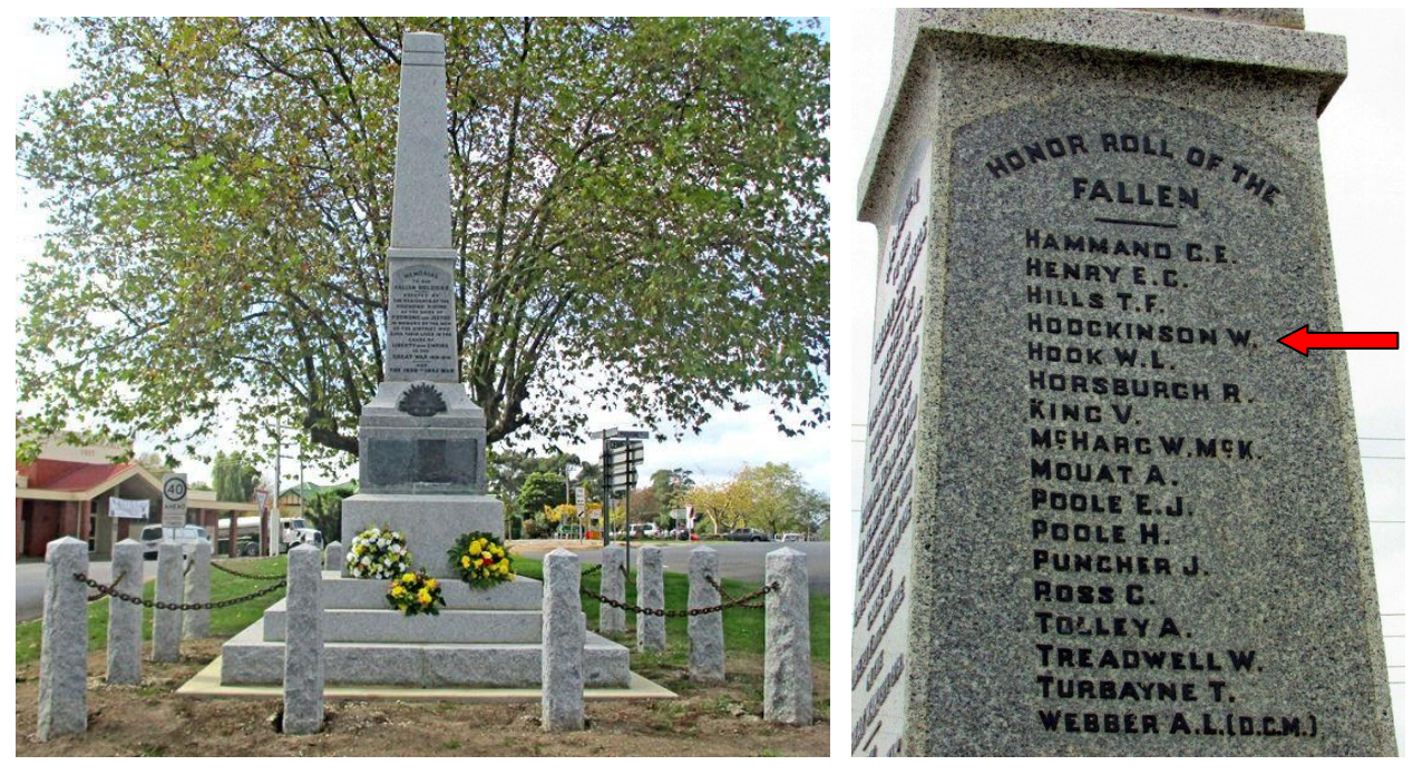
Poowong War Memorial

W. Hodgkinson is remembered on the Poowong War Memorial, located at Junction of Loch- Poowong Road & Nyora Road, Poowong, Victoria.