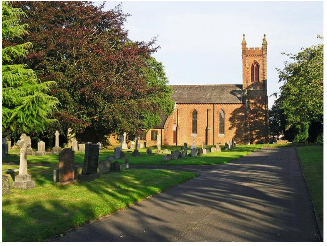
St John the Baptist Church and Upperby Cemetery