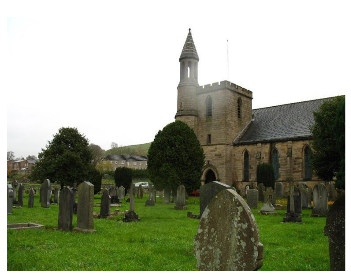
Holy Ascension Churchyard, Settle