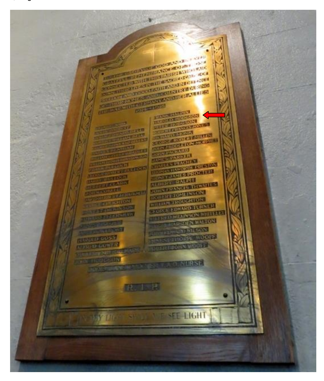
Church of Holy Ascension Roll of Honour, Settle

Harold Hodgson is remembered on the Church of Holy Ascension Roll of Honour located at Church Street, Settle, North Yorkshire, England.