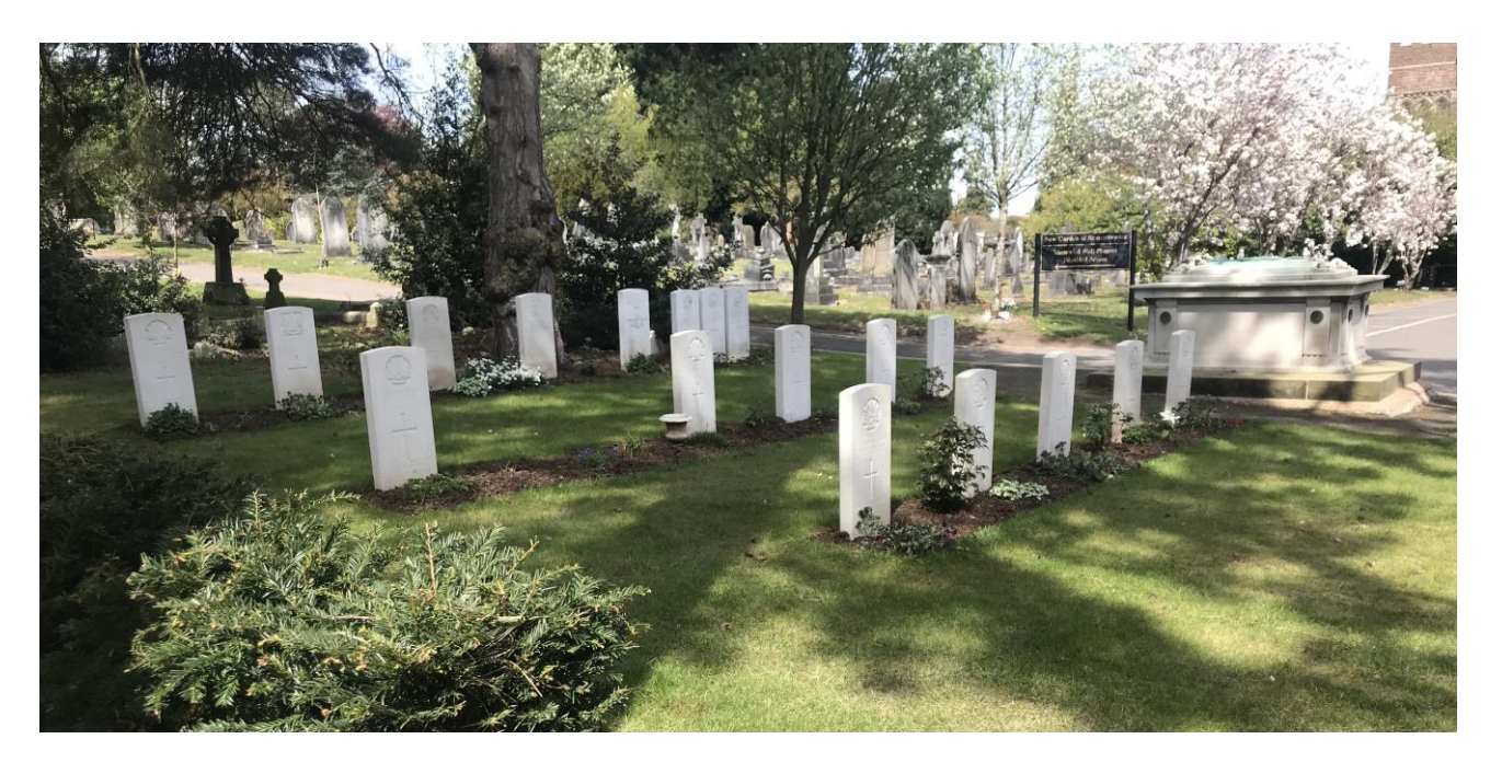
Australian Plot