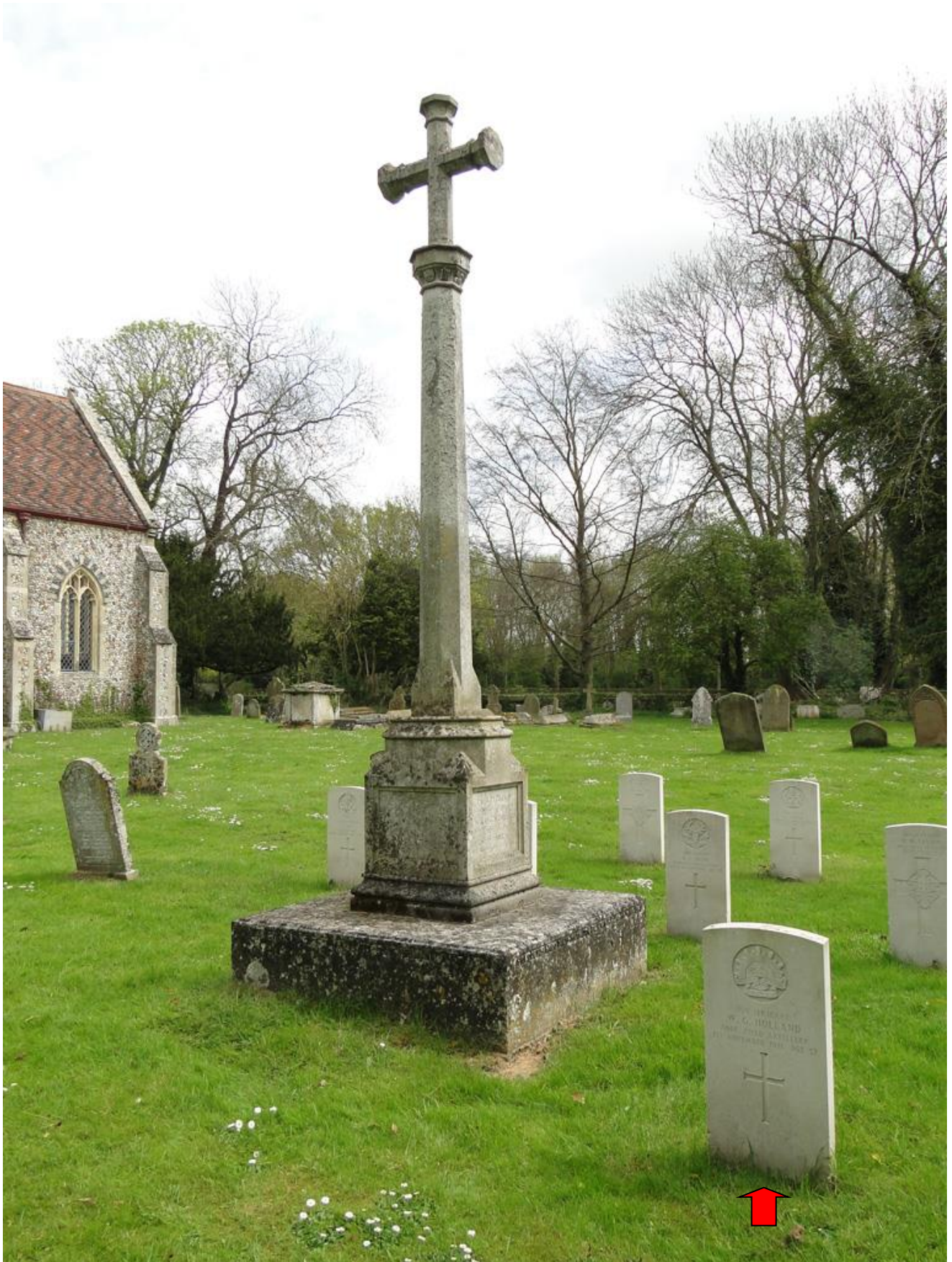
St. Bartholomew's Church, Ingham War Memorial for Ampton Hall Red Cross Hospital.