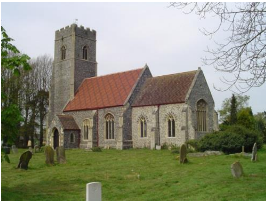
St. Bartholomew Churchyard, Ingham, Surrey

St. Bartholomew Churchyard, Ingham contains 10 War Graves, all but one being World War 1 graves. There are 2 Australian Soldiers buried in this Churchyard.