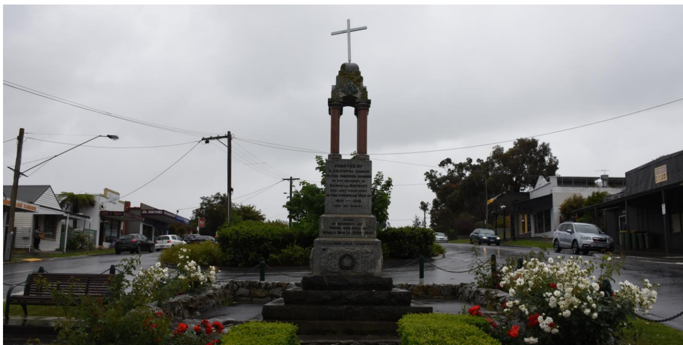
Bunyip War Memorial