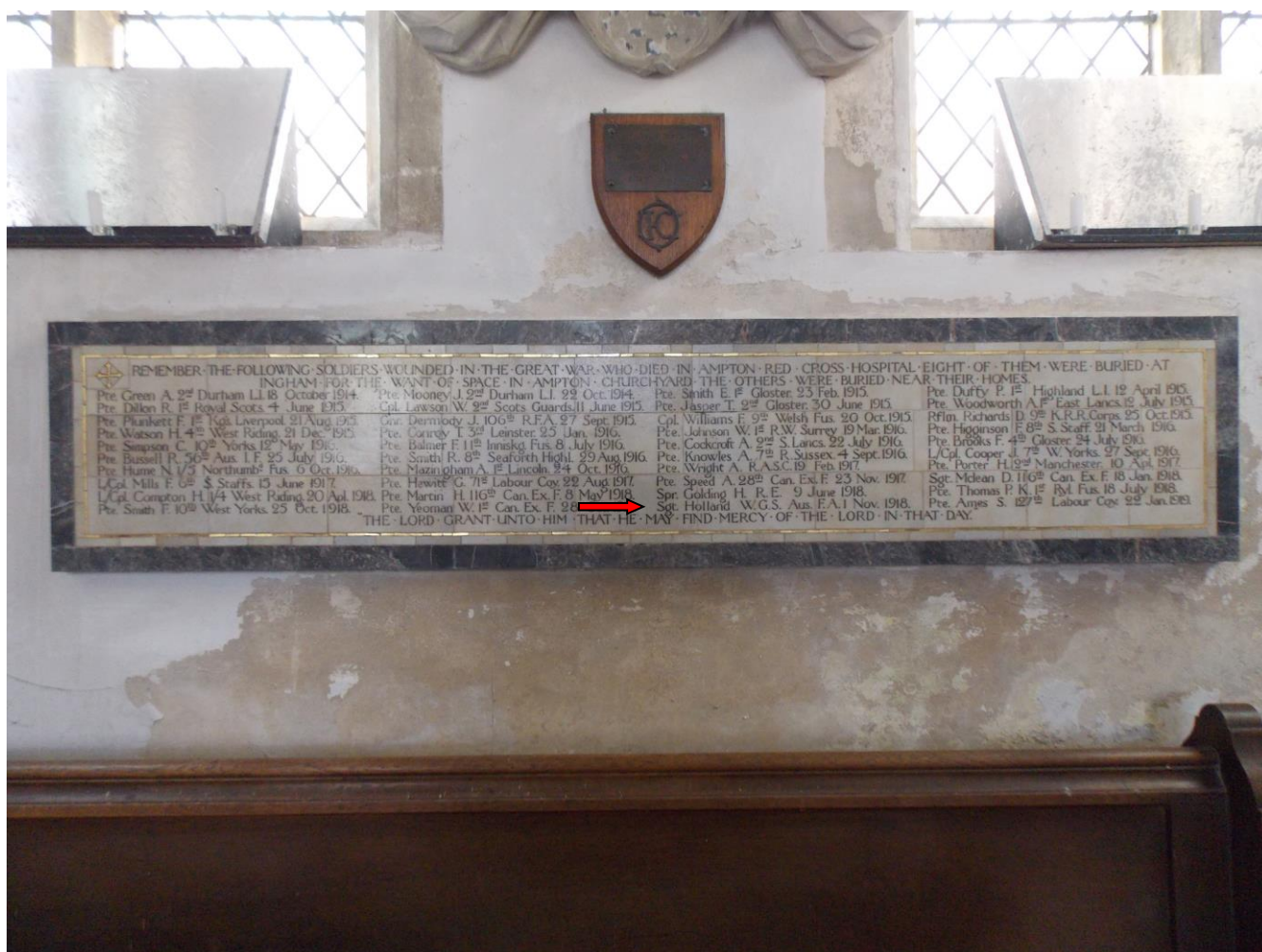
Ampton Hospital Memorial