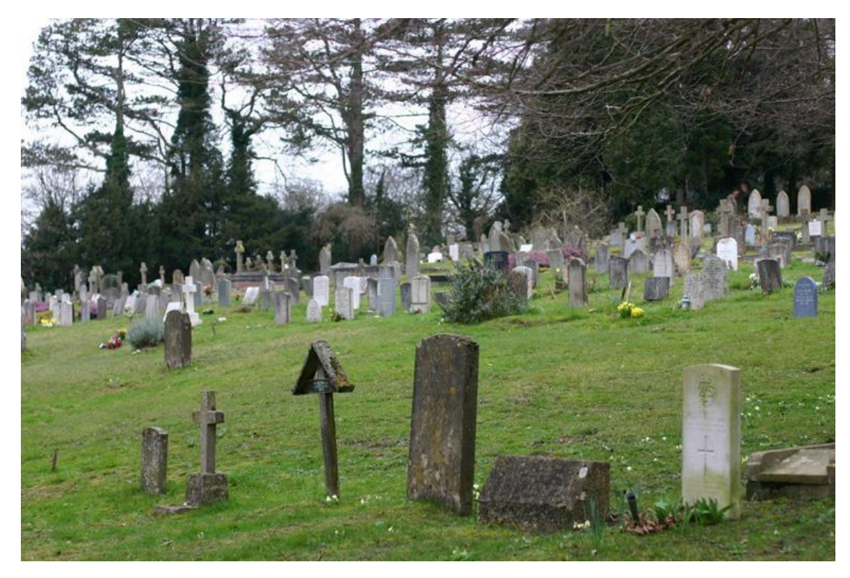
Painswick Cemetery

Painswick Cemetery contains 13 Commonwealth War Graves, 11 relating to World War 1 & 2 relating to World War 2.