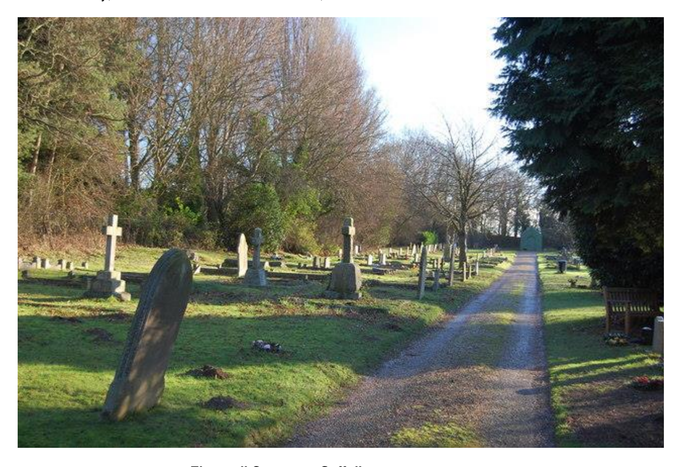
Elmswell Cemetery, Suffolk

Elmswell Cemetery, Suffolk contains three War Graves, two from World War 1 & one from World War 2.