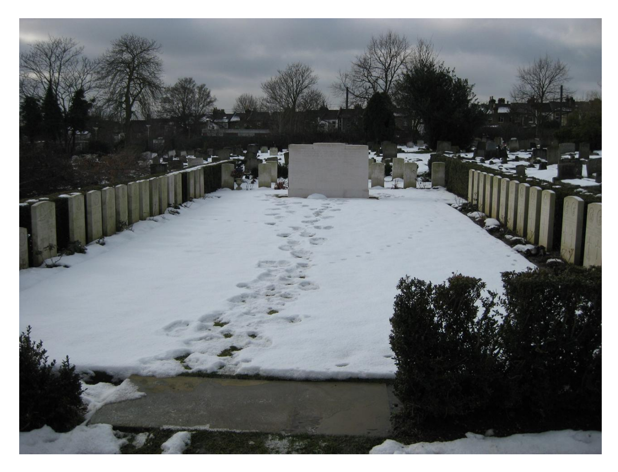
Beckenham Crematorium & Cemetery