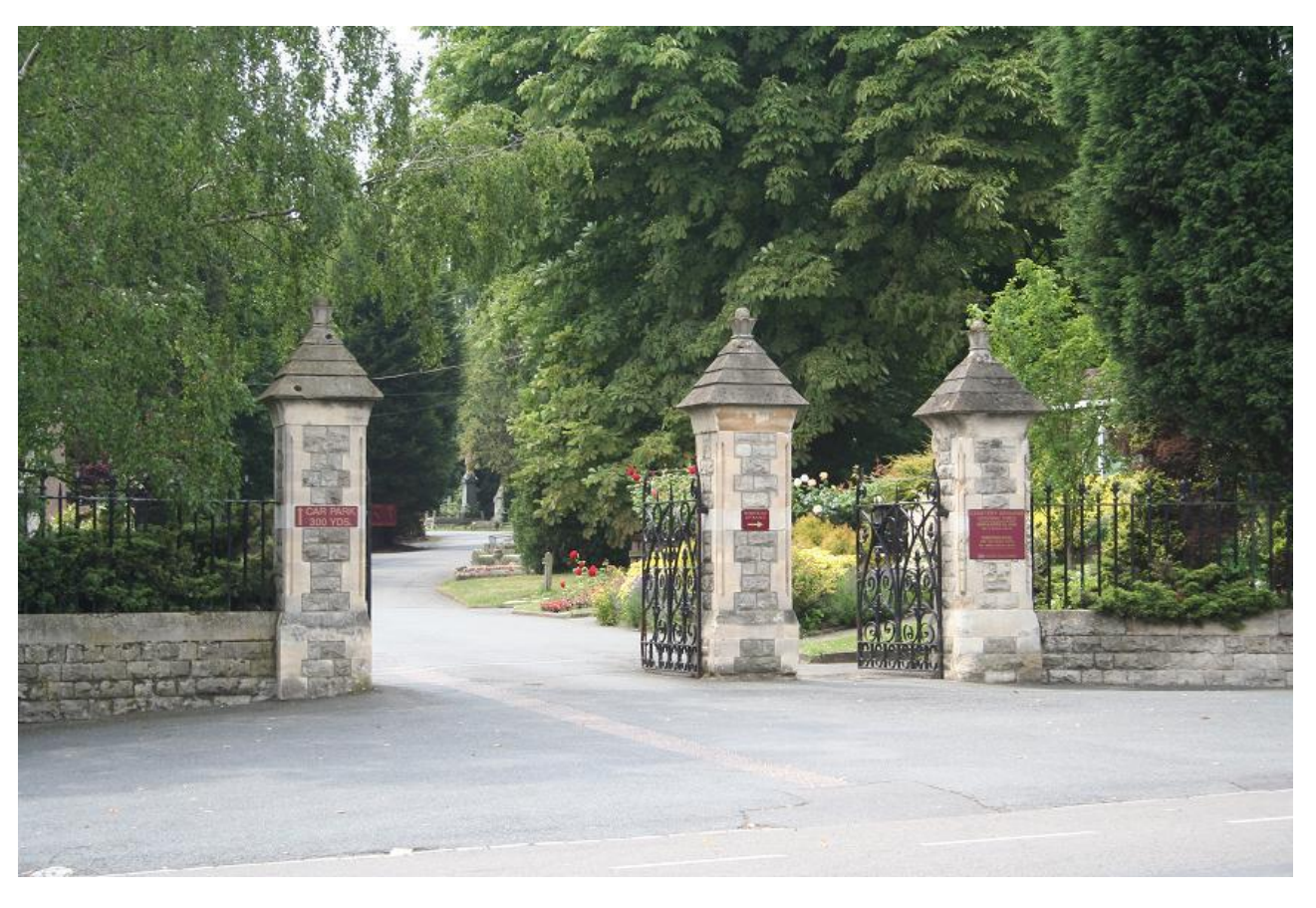
Beckenham Crematorium & Cemetery