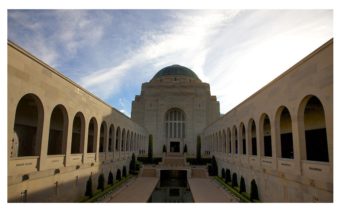
Commemorative Area of the Australian War Memorial