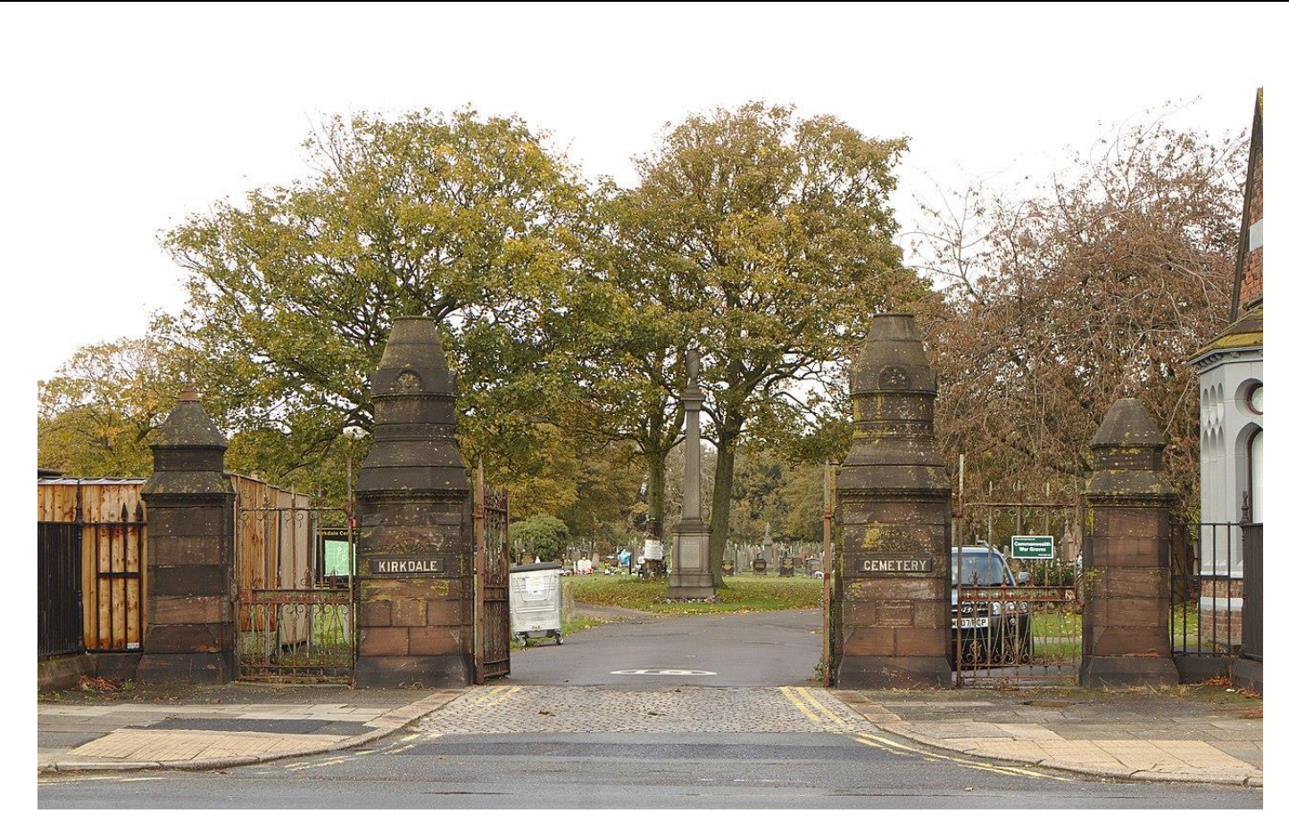
Kirkdale Cemetery