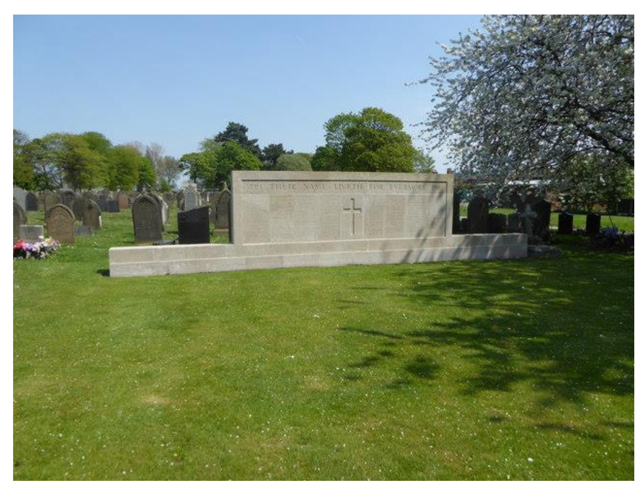
CWGC Screen Wall in Kirkdale Cemetery