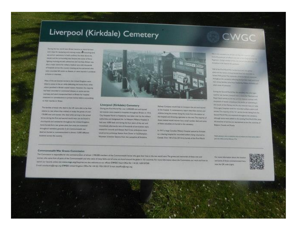
CWGC Information Board in Kirkdale Cemetery