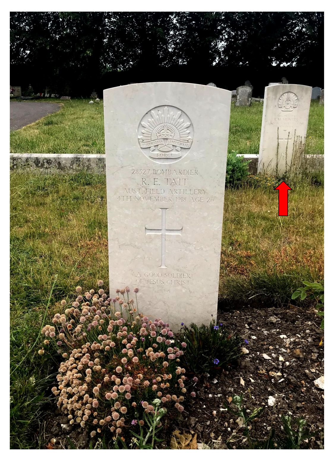
Private Hunter's headstone in background