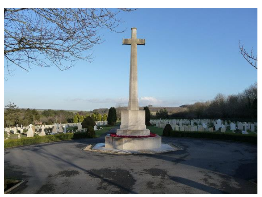
Tidworth Military Cemetery, Wiltshire