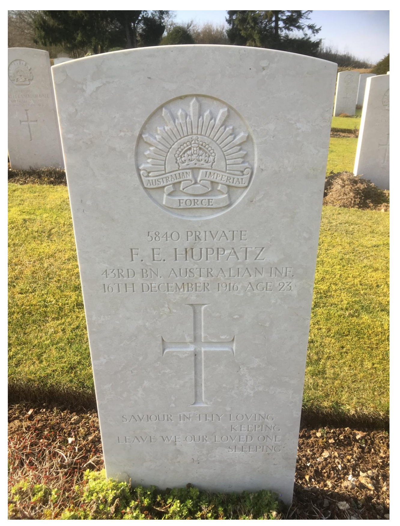
Photo of Private F. E. Huppatz's Commonwealth War Graves Commission Headstone in Tidworth Military Cemetery, Wiltshire, England.