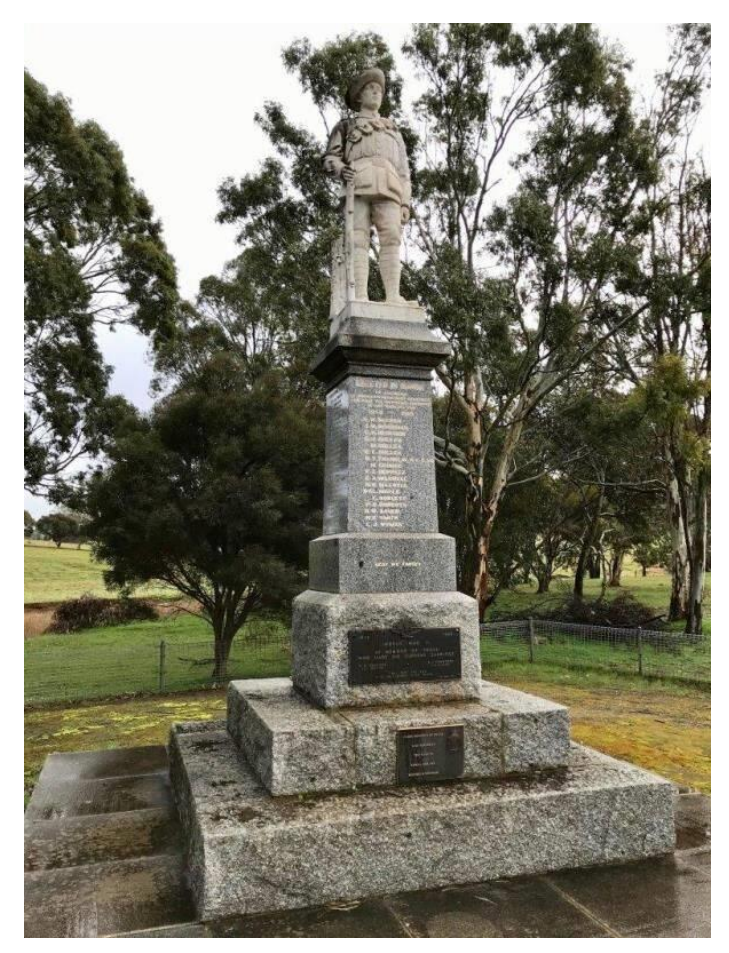
Saddleworth War Memorial