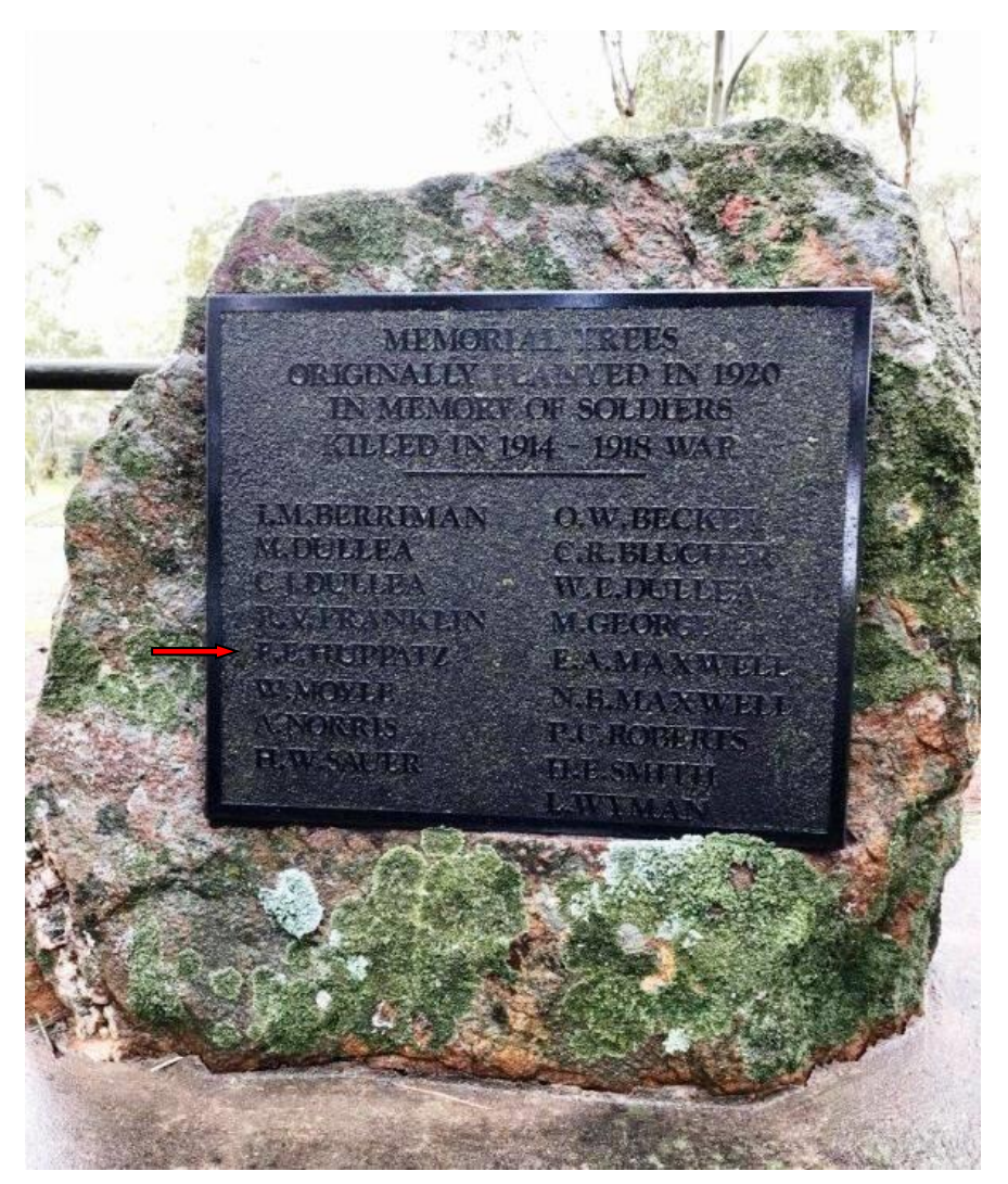
Saddleworth Memorial Avenue