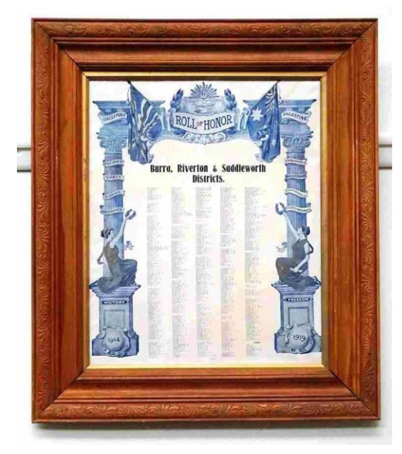
Burra, Riverton & Saddleworth Districts Roll of Honour