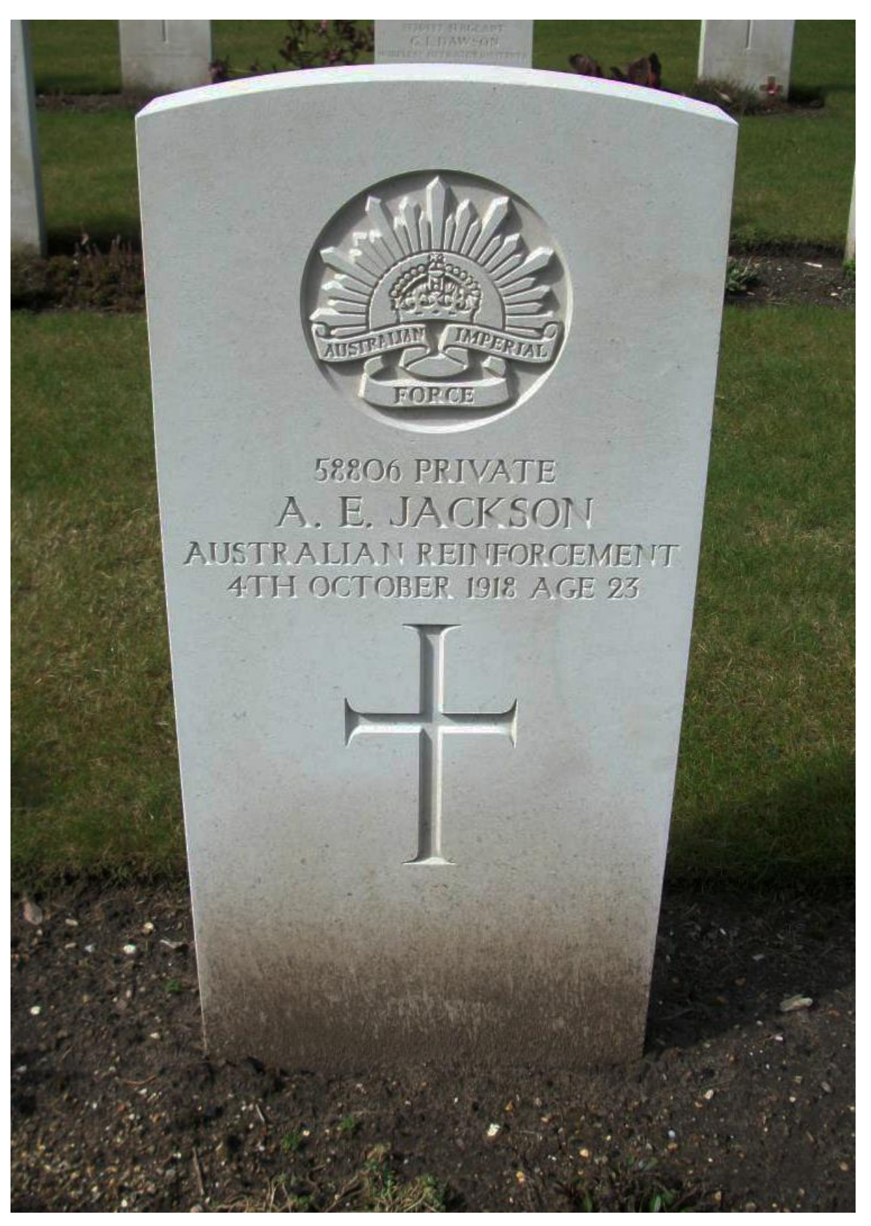
Photo of Private A. E. Jackson's Commonwealth War Graves Commission Headstone in Brookwood Military Cemetery, Surrey, England.