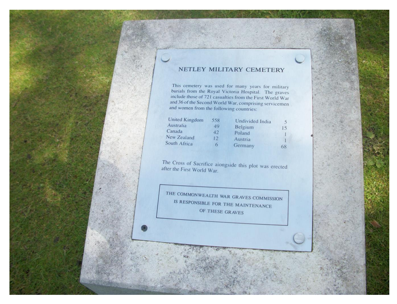
Netley Military Cemetery, Hampshire