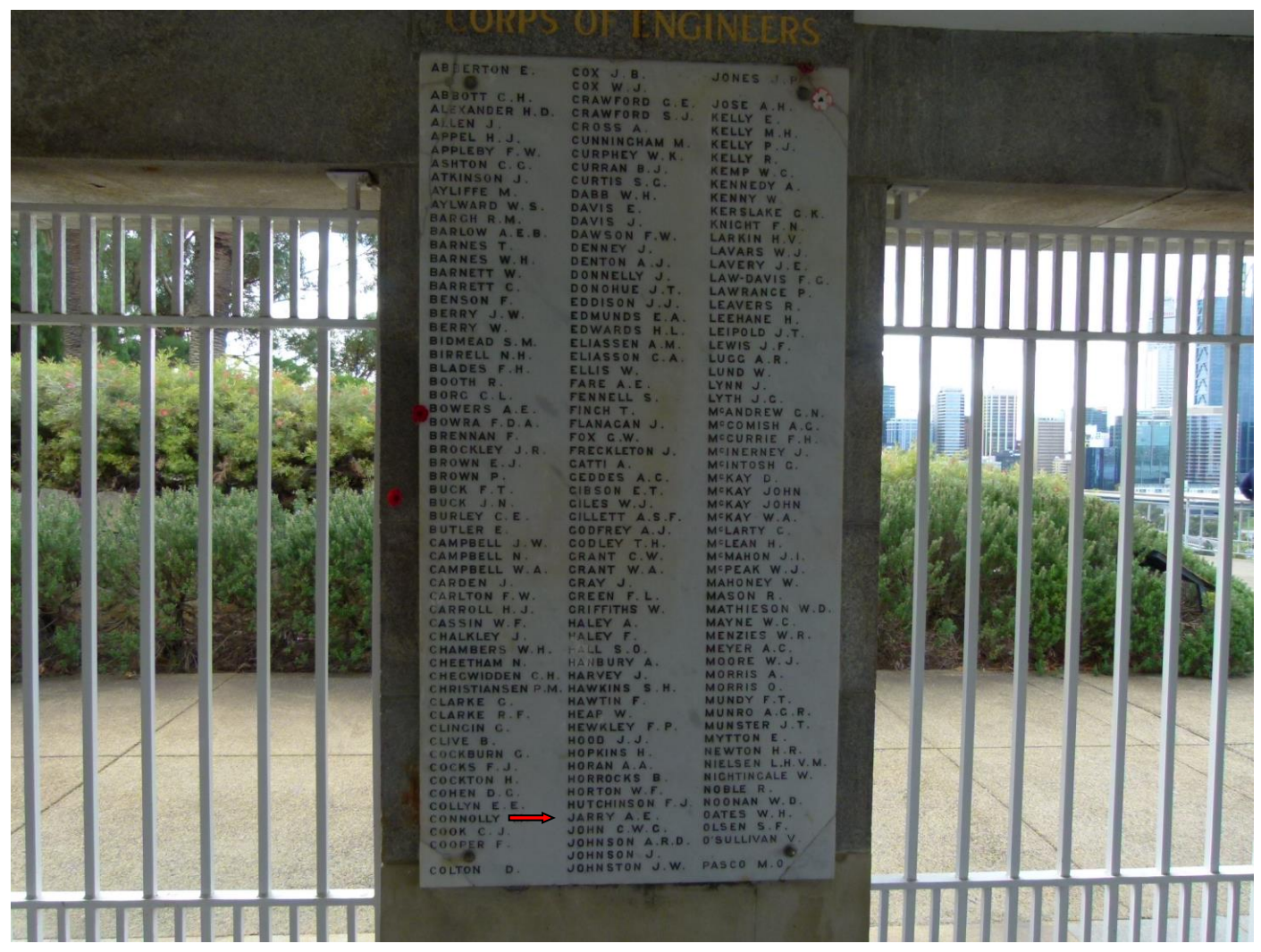
Corps of Engineers Panel