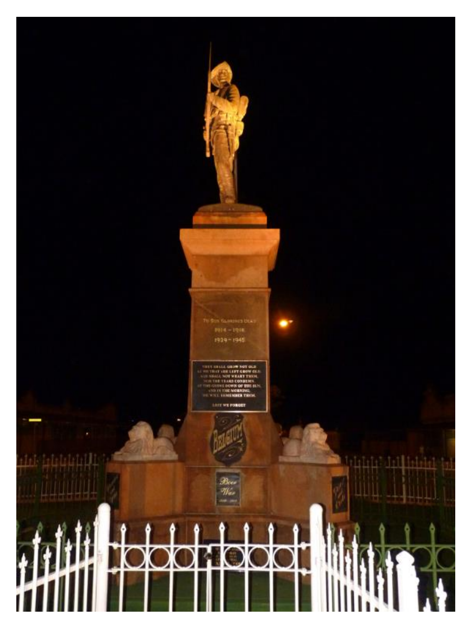
Kalgoorlie Fallen Soldiers' Memorial

The Kalgoorlie Fallen Soldiers' Memorial, located at Kalgoorlie Railway Station, Forrest & Wilson Streets, Kalgoorlie, Western Australia does not list individual names.