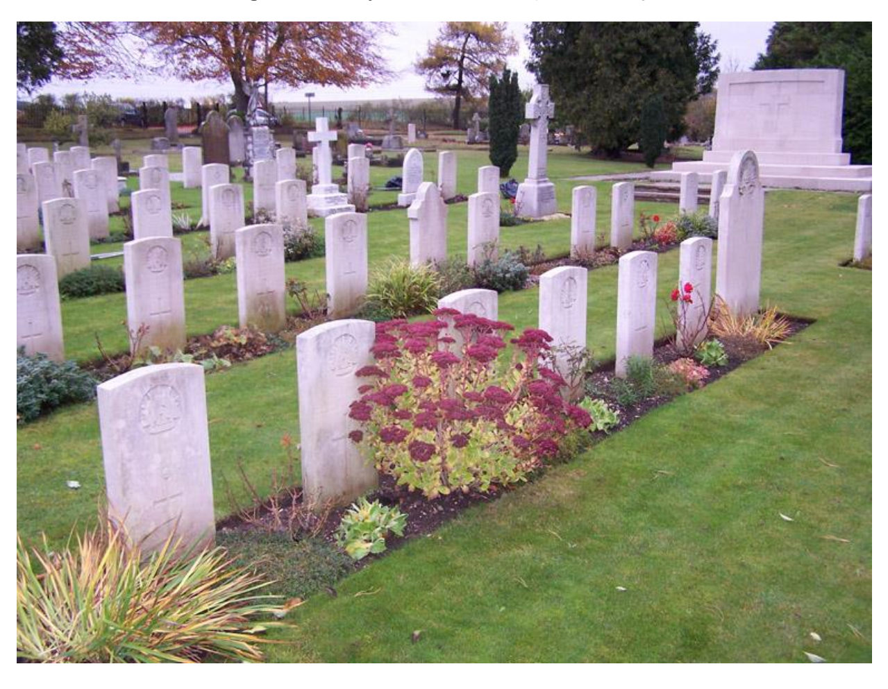
Durrington Cemetery, Wiltshire