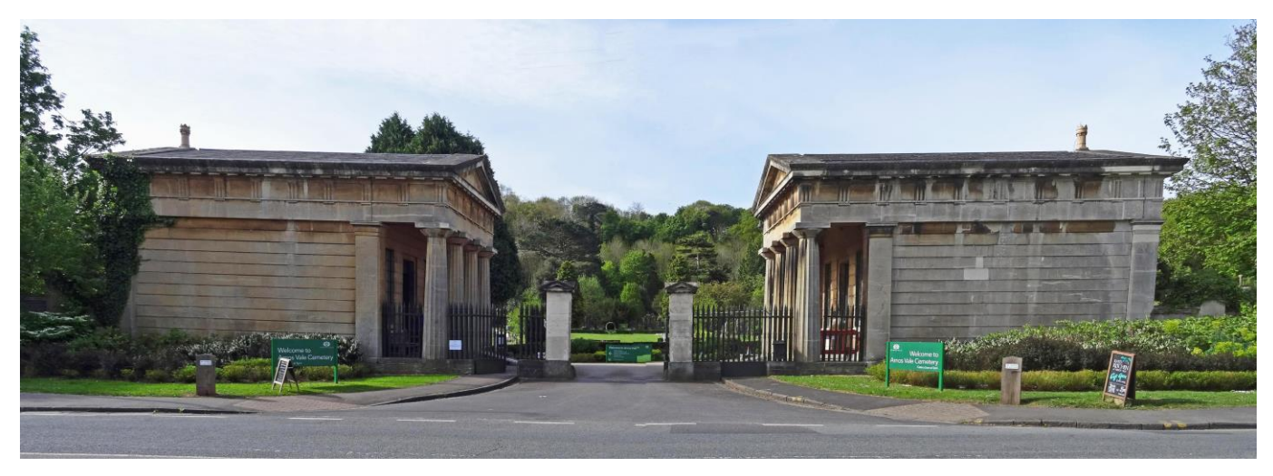
Arnos Vale Cemetery - Main Entrance on Bath Road