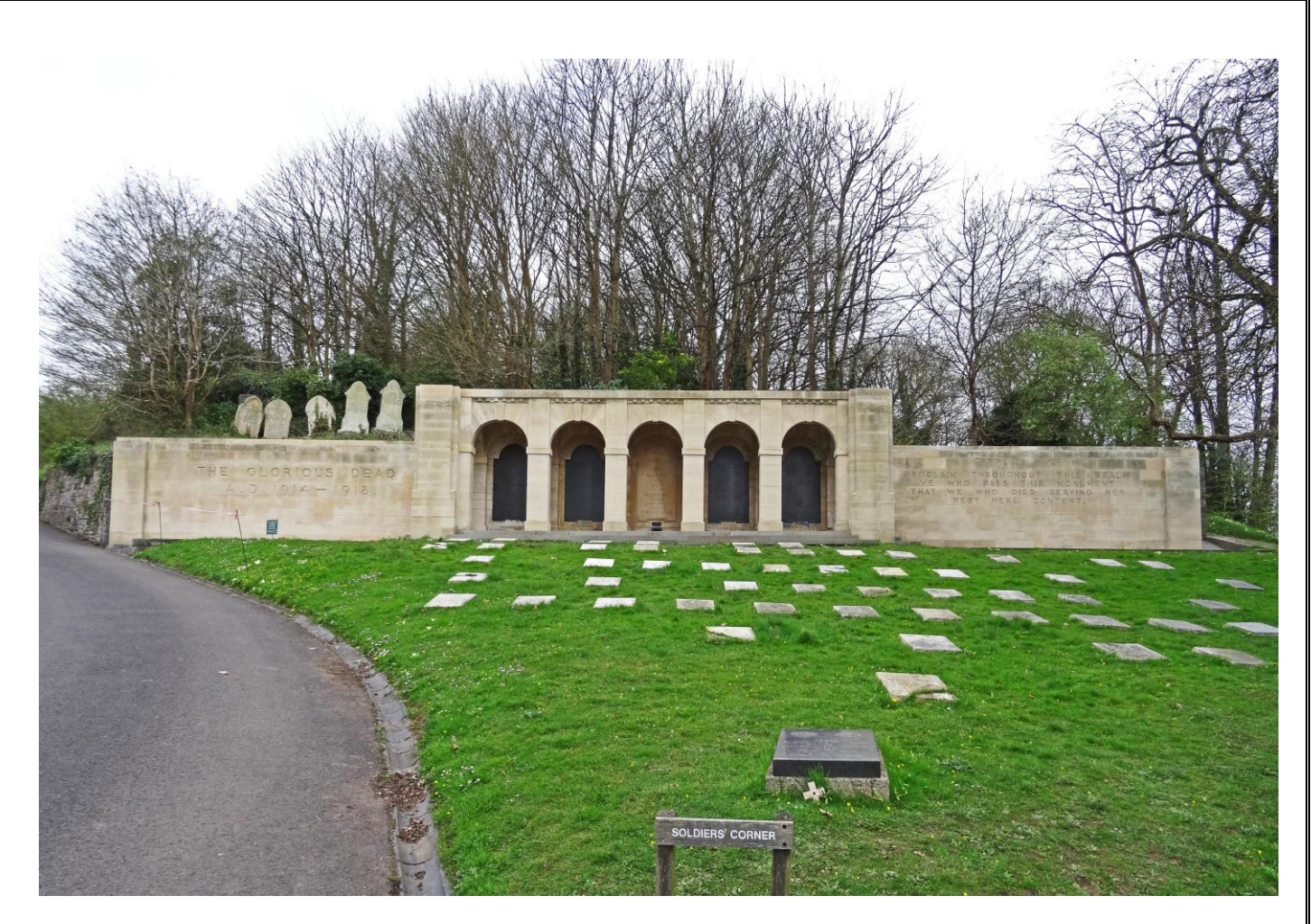
Soldiers' Corner – Arnos Vale Cemetery