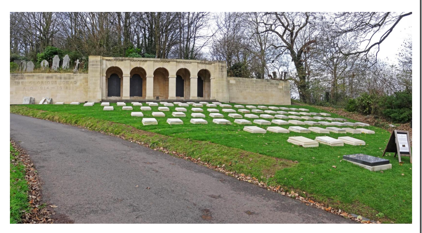
New Memorial Stones