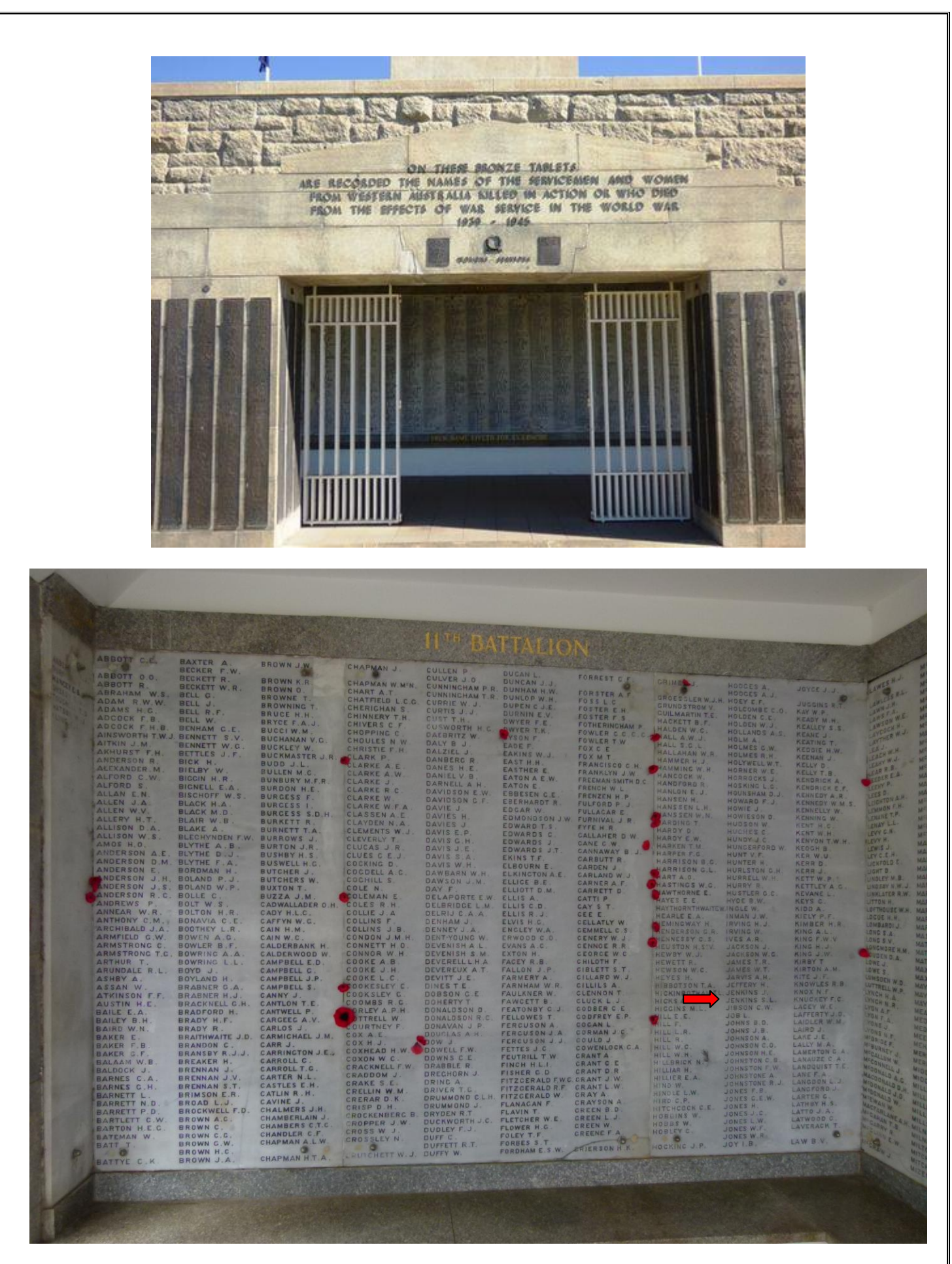
11th Battalion Panel