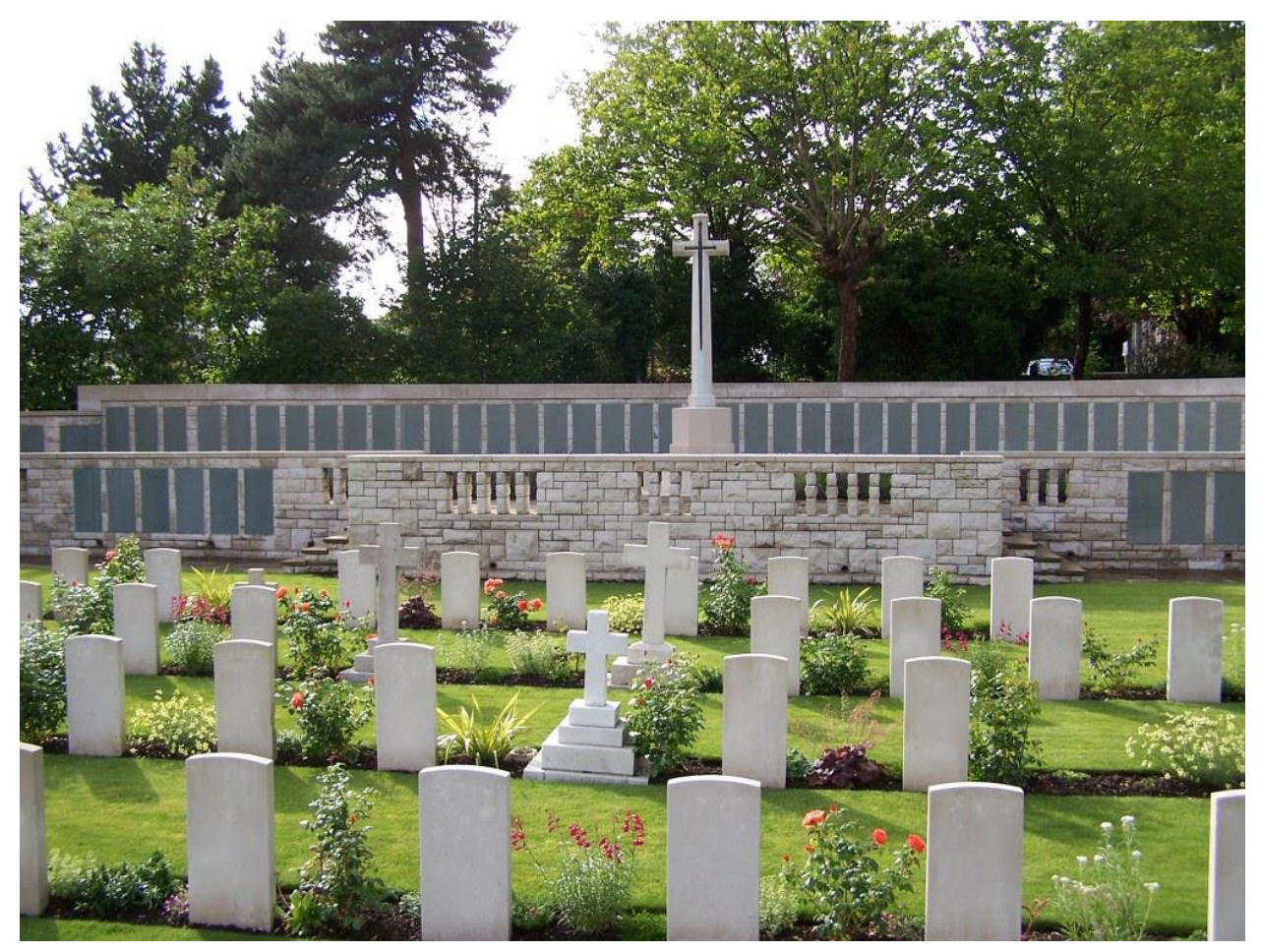
CWGC Graves in Hollybrook Cemetery with Cross of Sacrifice & Hollybrook Memorial