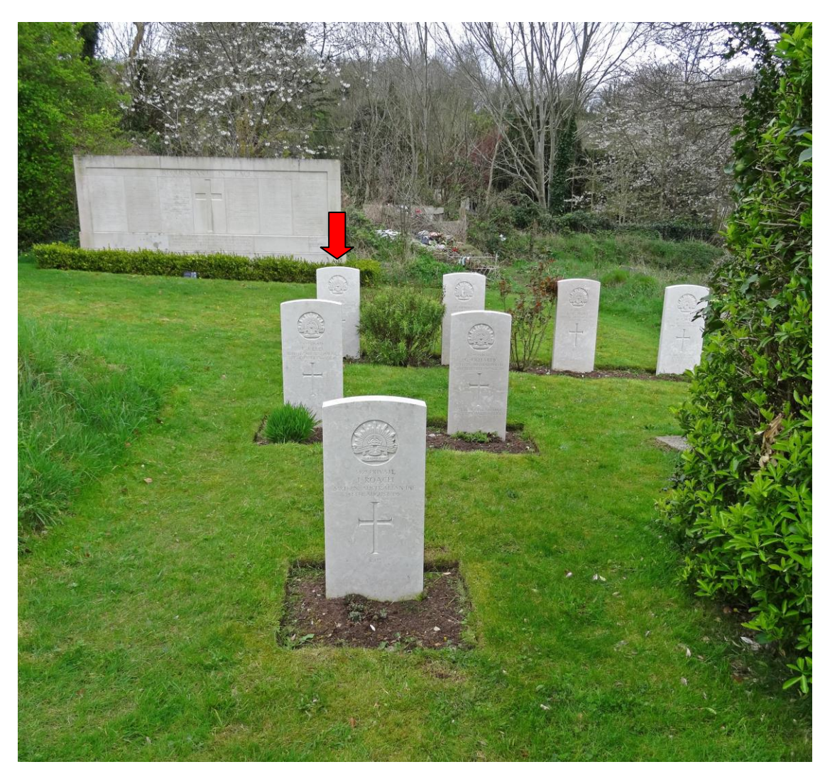
Australian World War 1 CWGC Headstones in Holy Souls Roman Catholic Cemetery Private Jess' headstone – back row; left