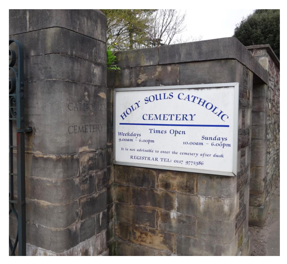
Holy Souls Roman Catholic Cemetery