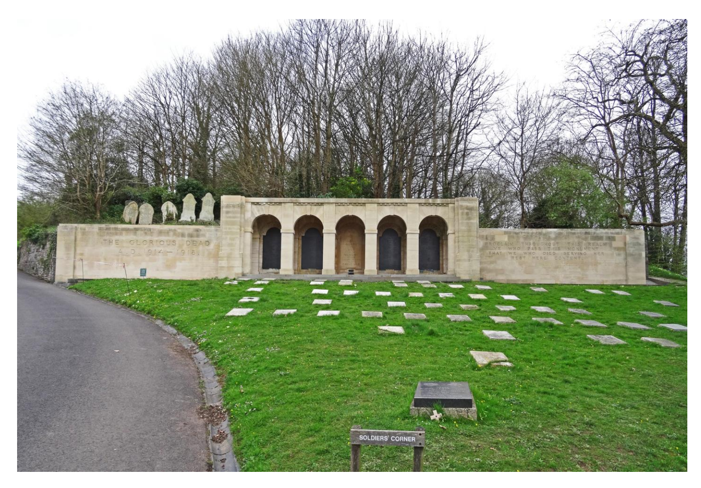
Soldiers' Corner – Arnos Vale Cemetery