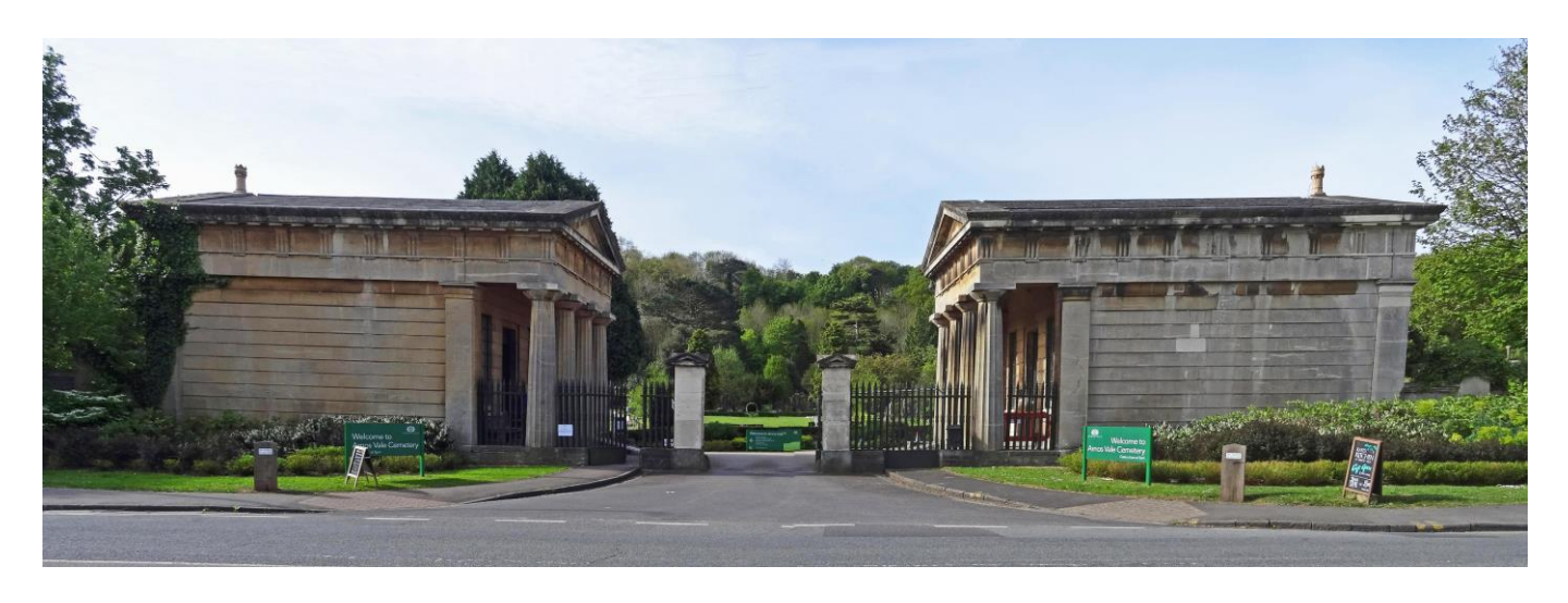
Arnos Vale Cemetery - Main Entrance on Bath Road