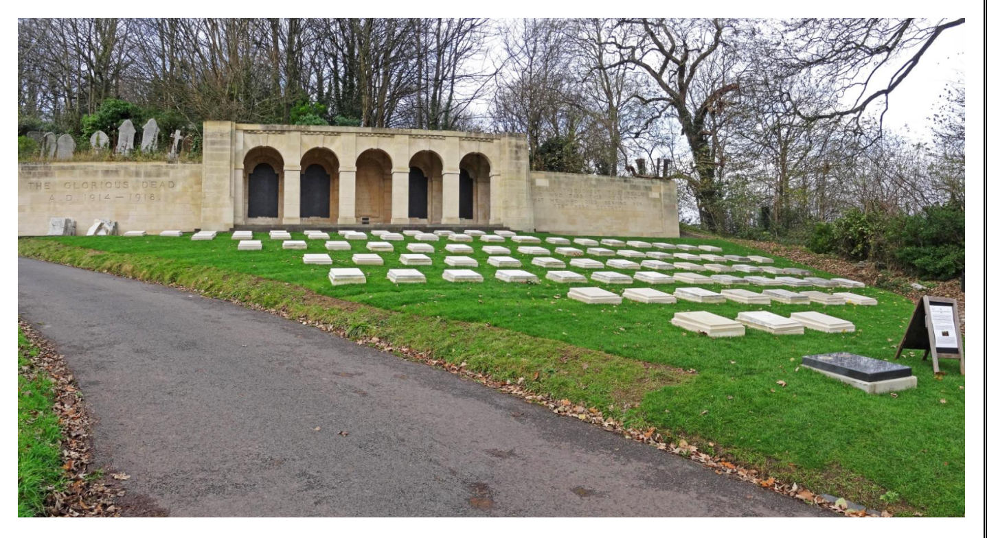
New Memorial Stones