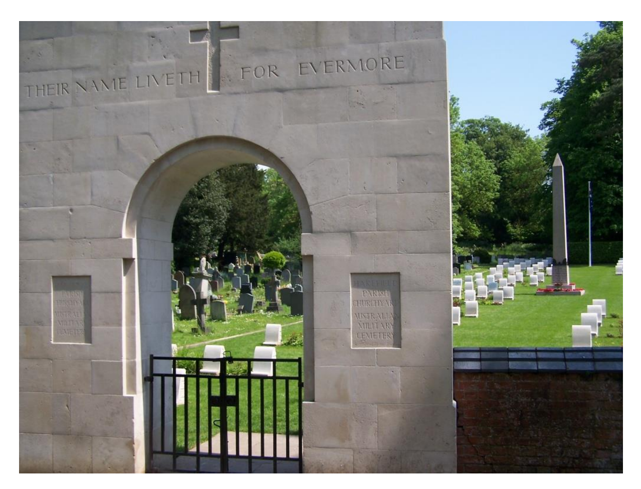
St. Mary the Virgin Churchyard, Harefield