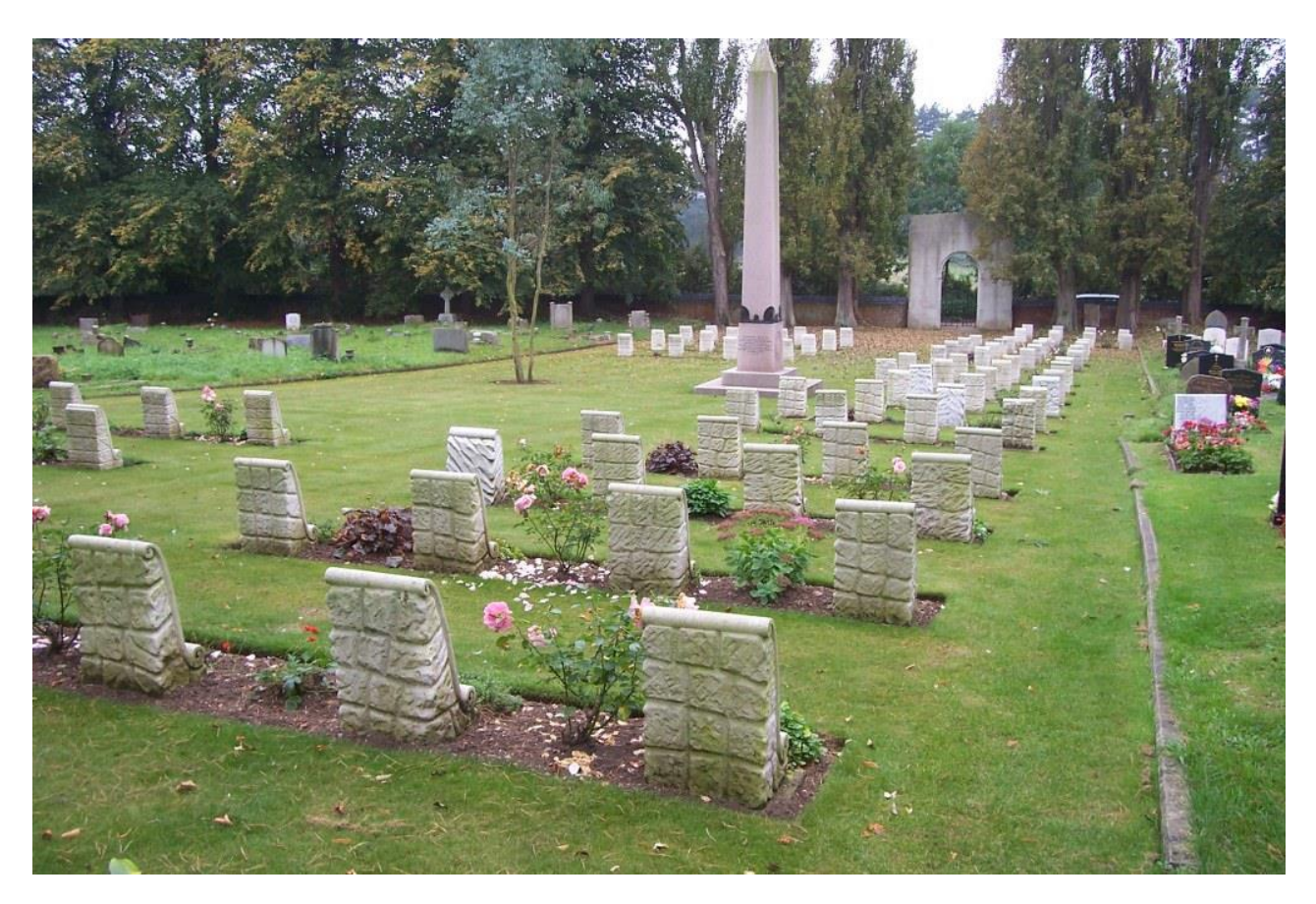
St. Mary the Virgin Churchyard, Harefield