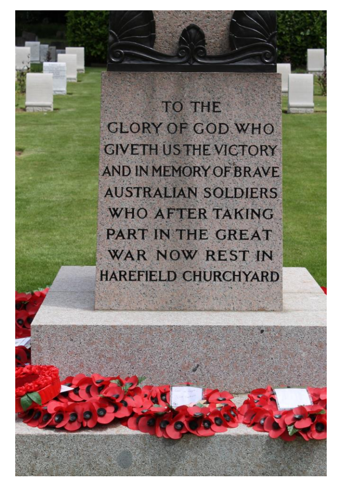
St. Mary the Virgin Churchyard, Harefield