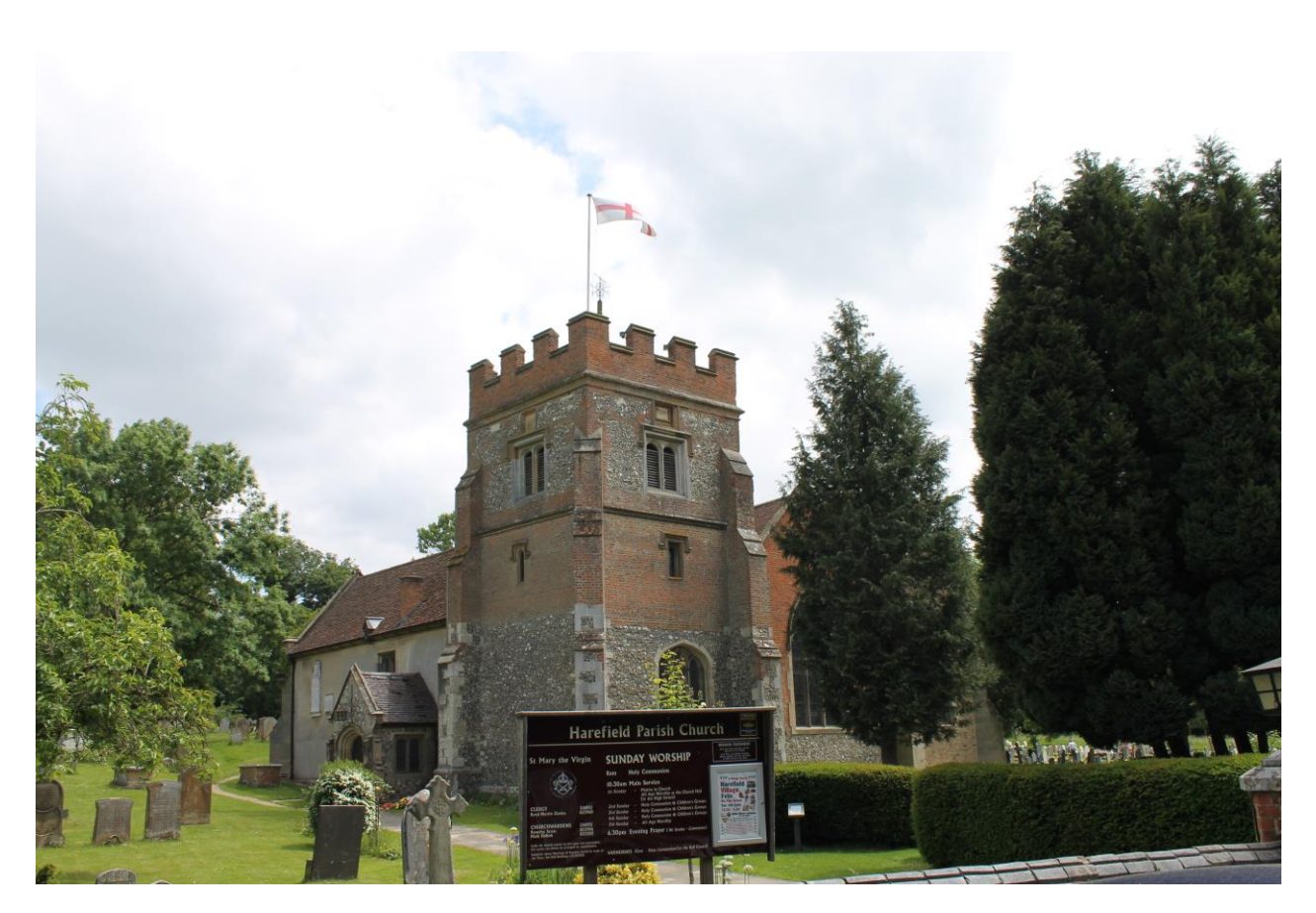
St Mary the Virgin Church, Harefield