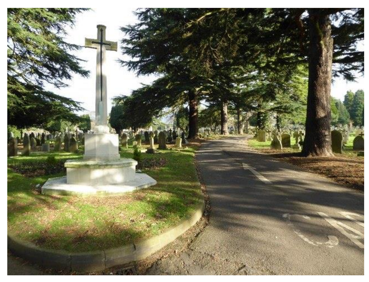
Cross of Sacrifice in Cheltenham Cemetery, Gloucestershire