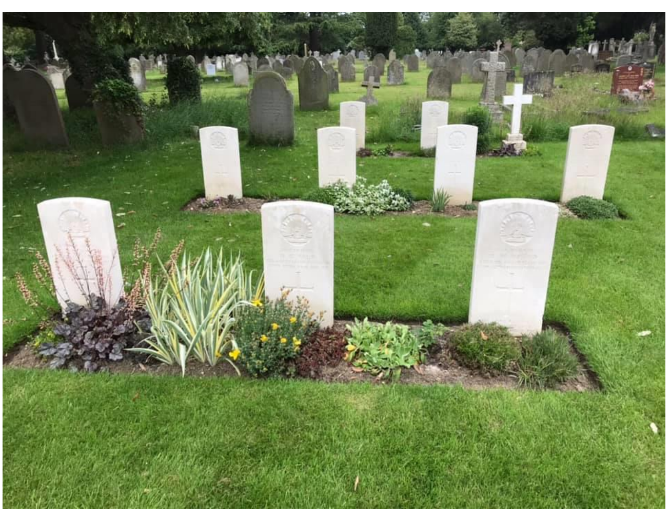
Australian Plot