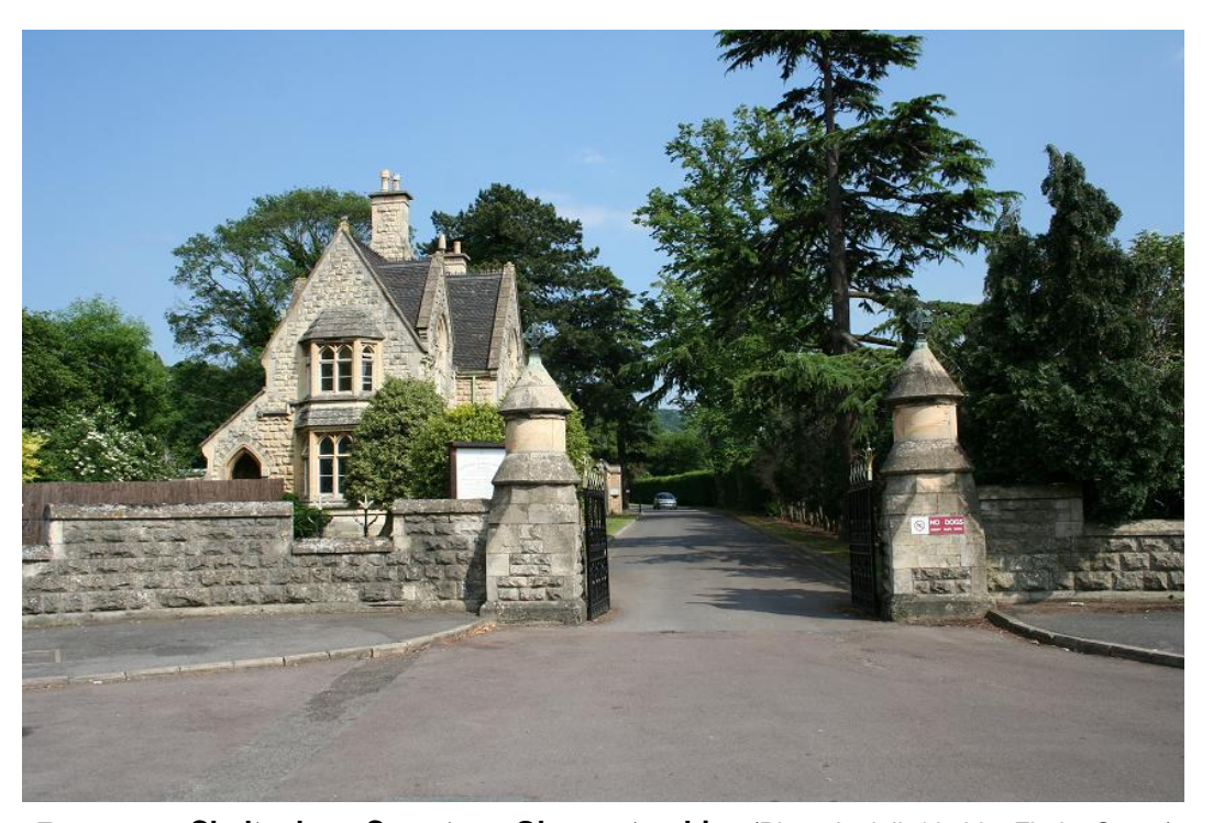
Entrance to Cheltenham Cemetery, Gloucestershire