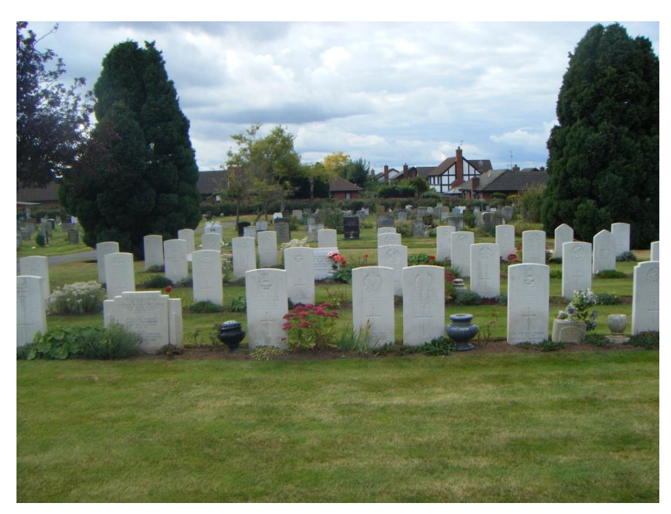
War Graves in Cheltenham Cemetery, Gloucestershire