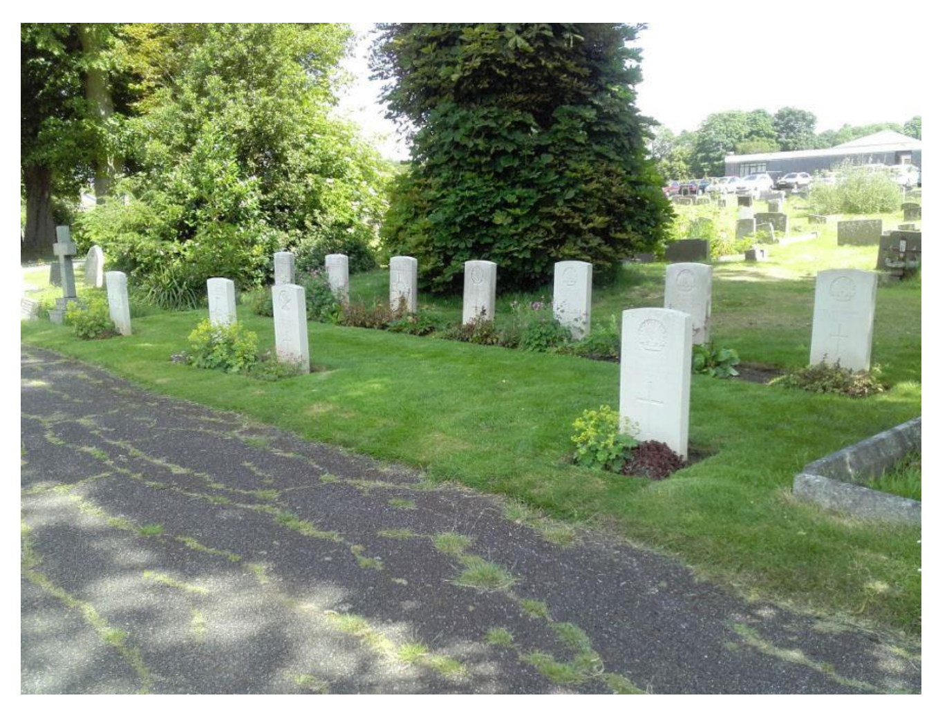
Grantham Cemetery – Australian Plot