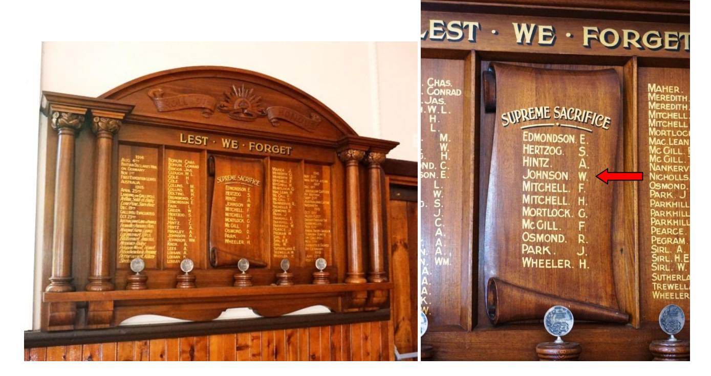
Bethanga Roll of Honour