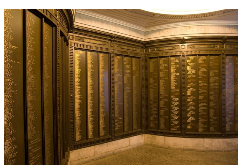
National War Memorial - Adelaide