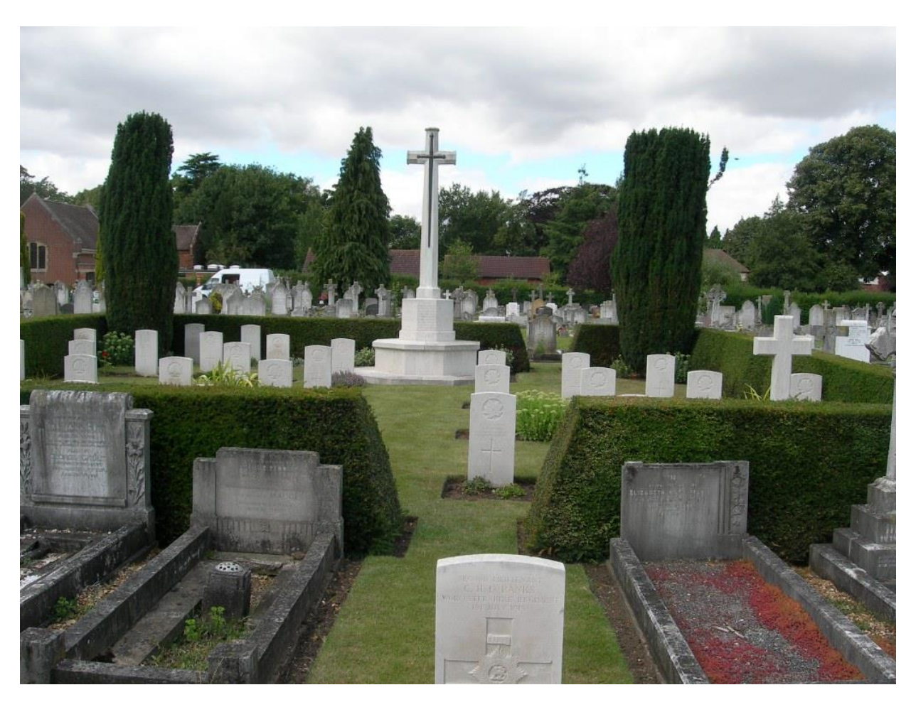
Cross of Sacrifice