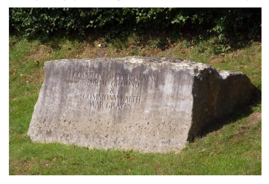
Compton Chamberlayne War Graves Cemetery

Compton Chamberlayne War Graves Cemetery contains 34 Commonwealth War Graves. There are 28 Australian War Graves, 4 British & 2 Irish. The War Graves, interspersed with some Public graves, are located in the front section of the Cemetery. The majority of the Public graves are in the back section of the Cemetery.