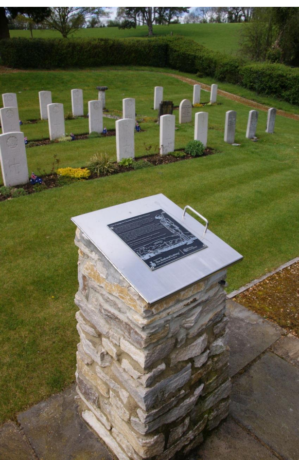
Looking left & right from front of Compton Chamberlayne Cemetery.