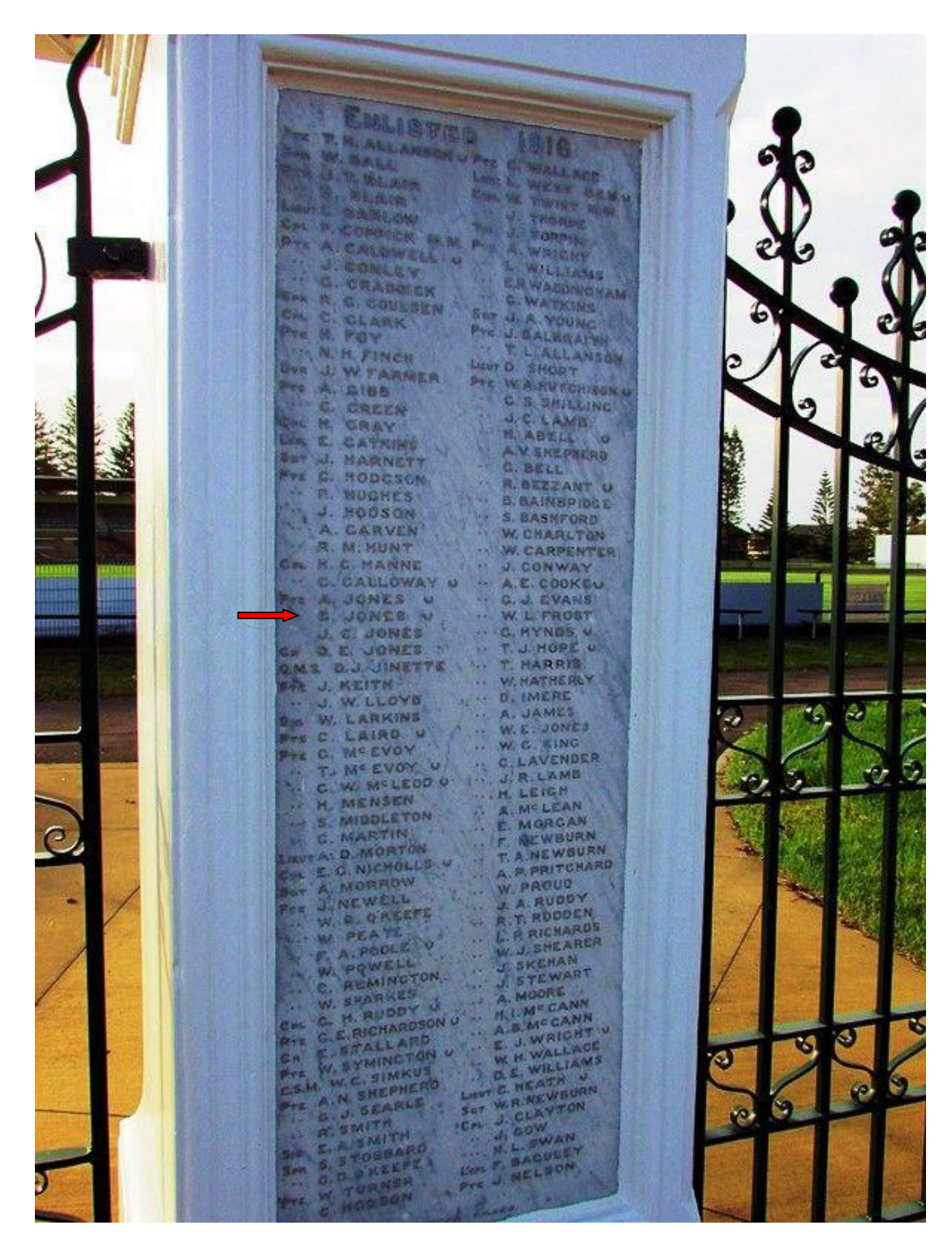
Mereweather Memorial Gates