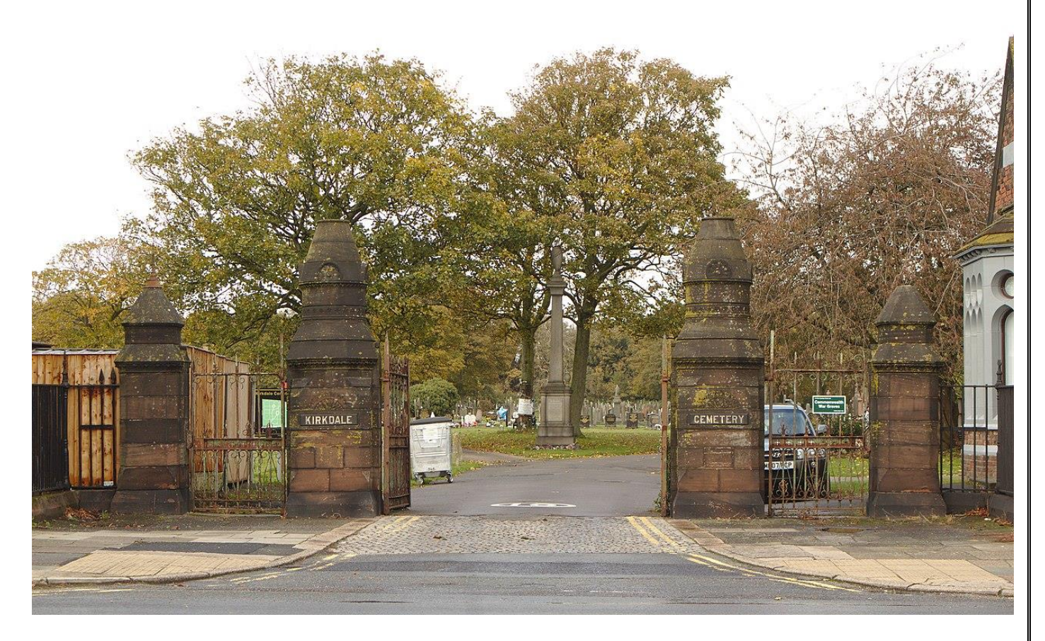
Kirkdale Cemetery