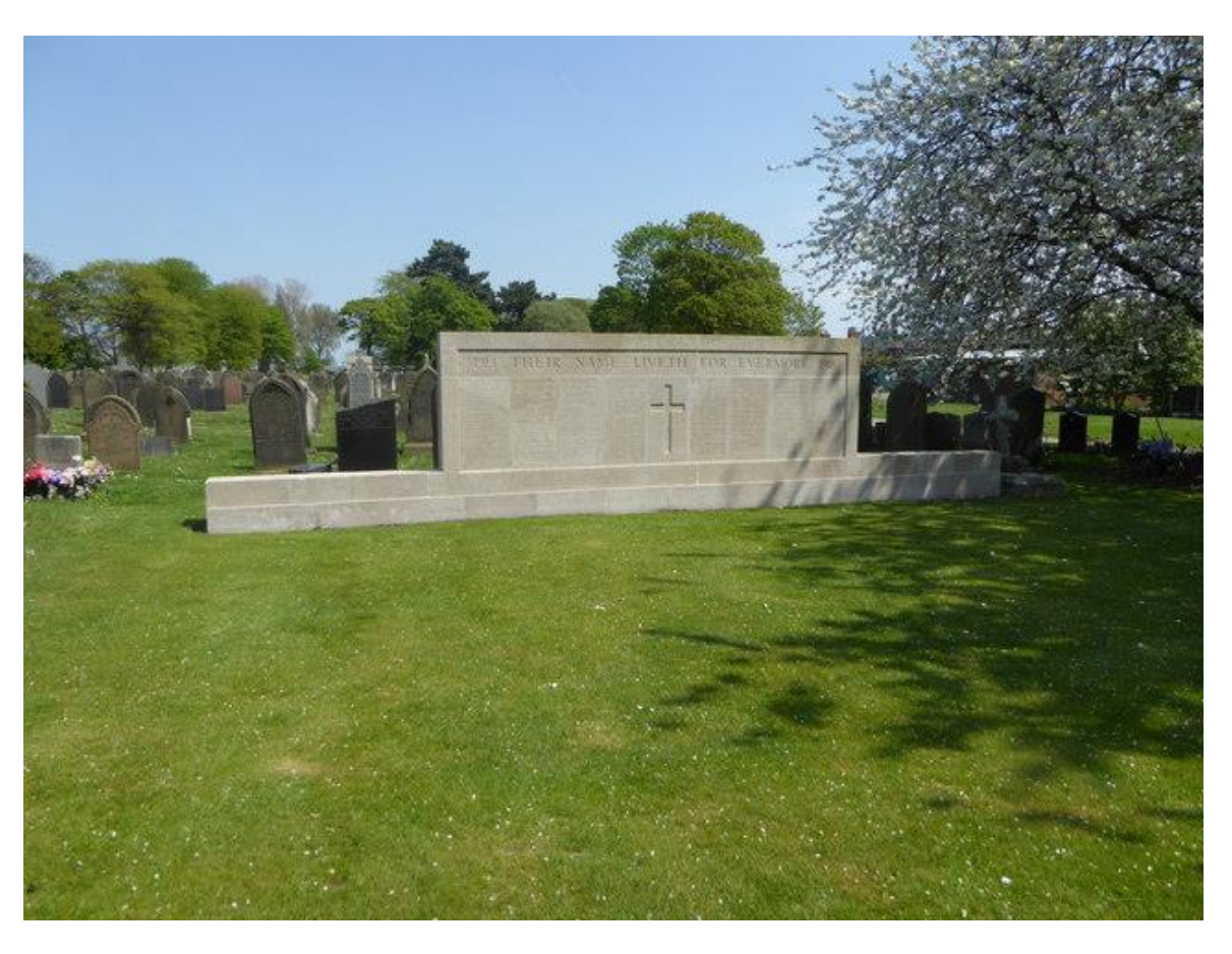
CWGC Screen Wall in Kirkdale Cemetery