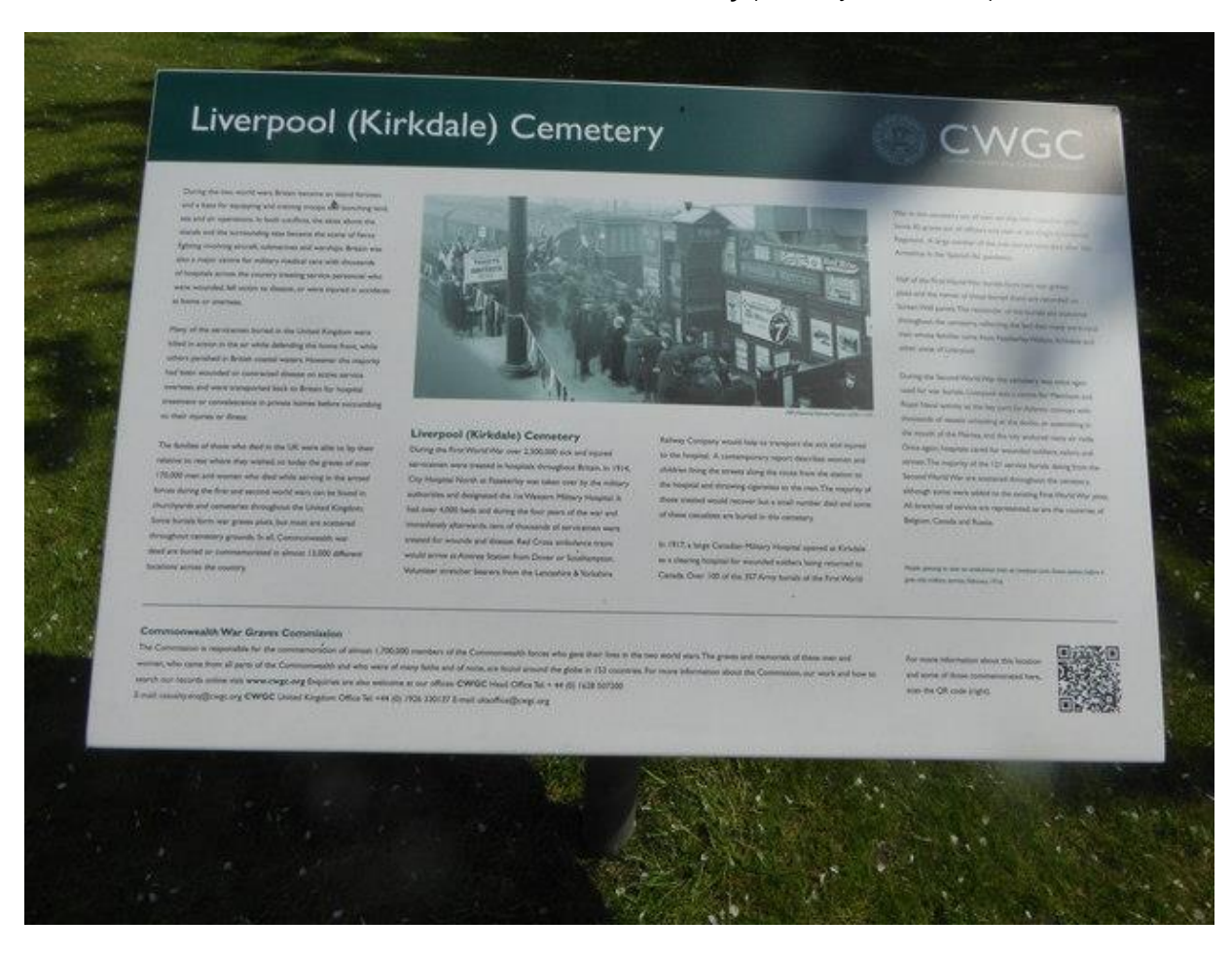
CWGC Information Board in Kirkdale Cemetery