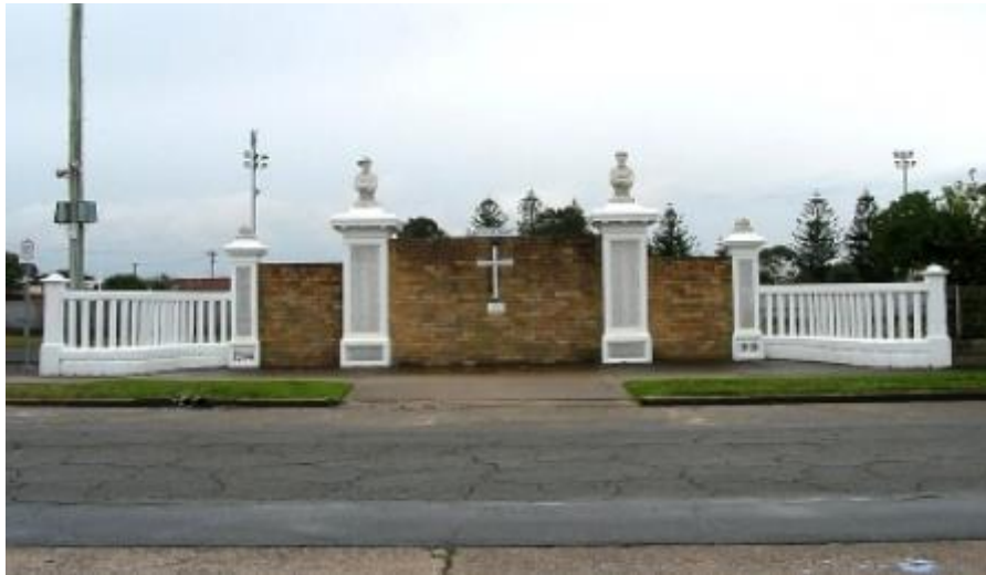
Mitchell Park, Memorial Gates at Merewether, NSW