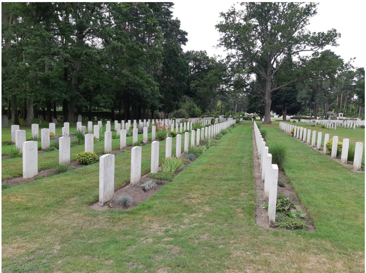
Australian War Graves