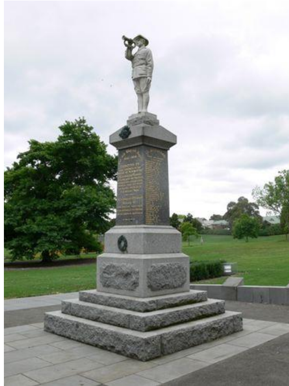
Box Hill War Memorial