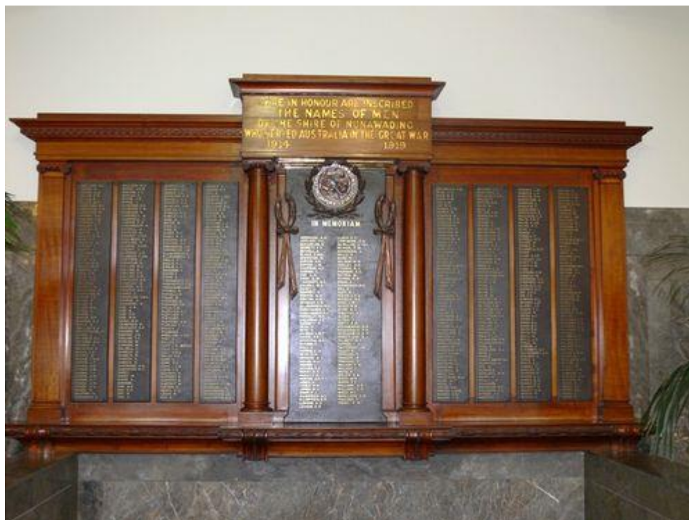
Shire of Nunawading Honour Roll

Between 1886 & 1945 Tunstall was the name of the present-day township of Nunawading, 18 km east of central Melbourne.