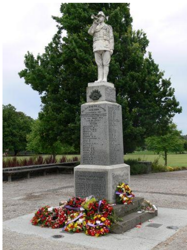
Mitcham War Memorial