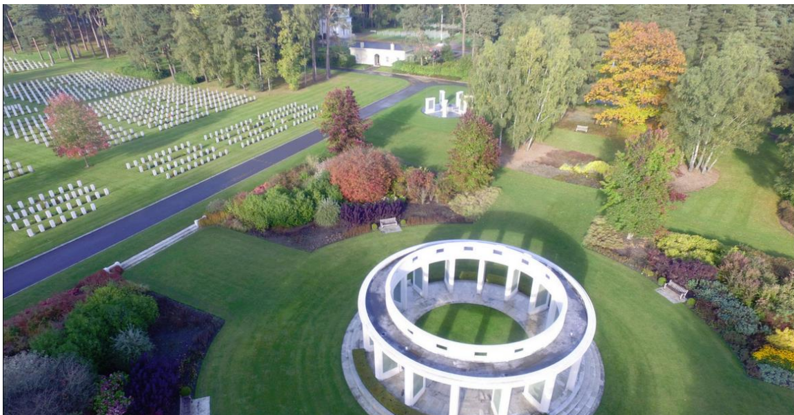
Brookwood Military Cemetery

There are 446 Australian War Graves in Brookwood Military Cemetery – 351 from World War 1 & 95 from World War 2.