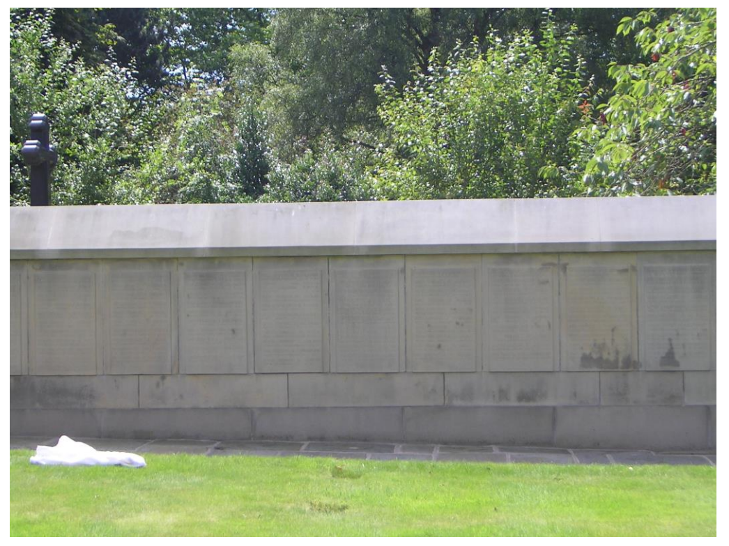
WW1 Screen Wall in Garden of Remembrance