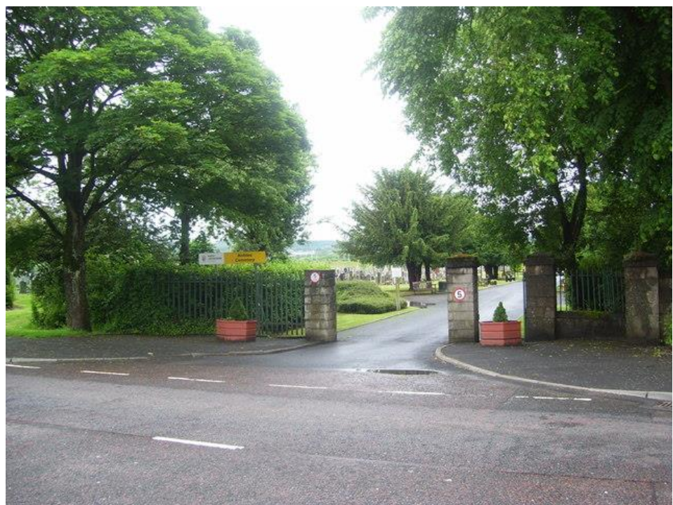
Entrance to Airbles Cemetery, Dalziel

Airbles Cemetery, Dalziel contains 79 Commonwealth War Graves – 25 relating to World War 1 & 54 relating to World War 2.