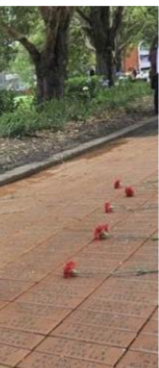
Honour Avenue War Memorial Fairfield