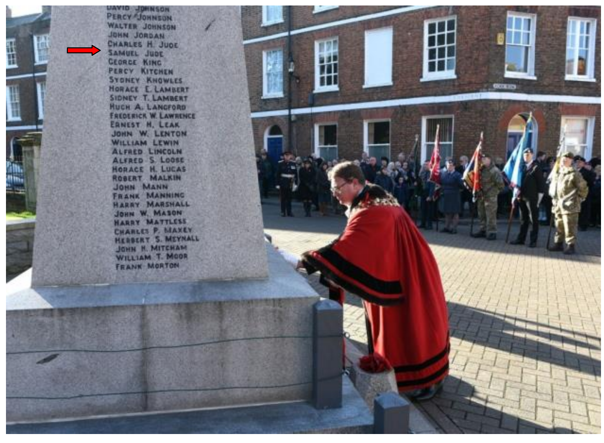
Remembrance Day, 2017