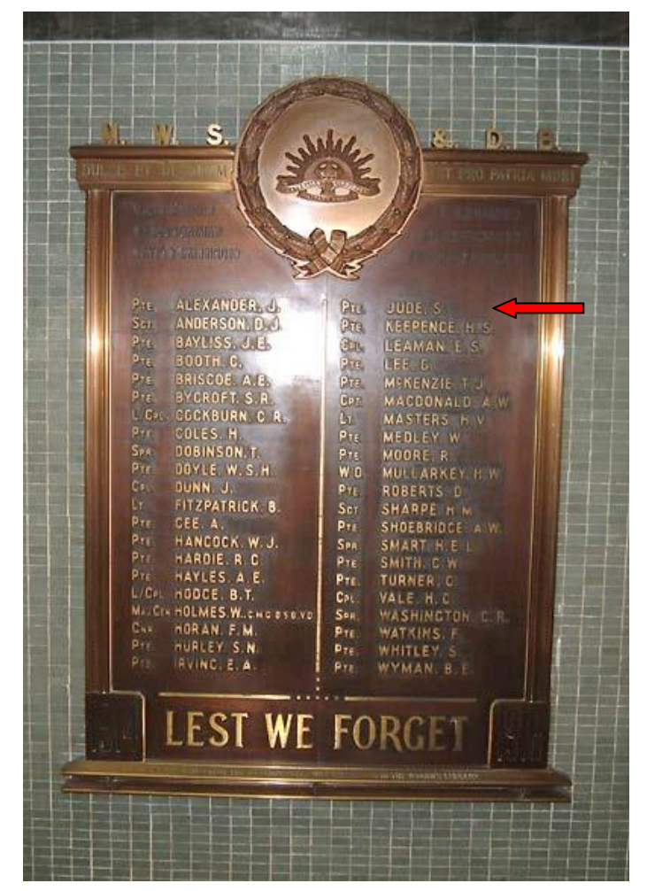
M.W.S. and D. B. Honour Board