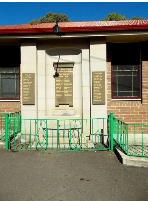
Guildford Soldiers Memorial