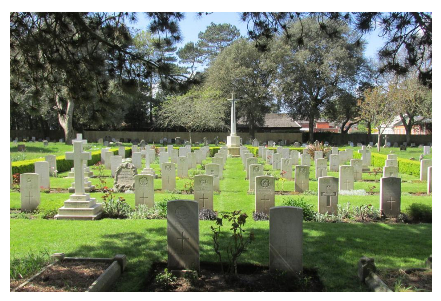
Bournemouth East Cemetery