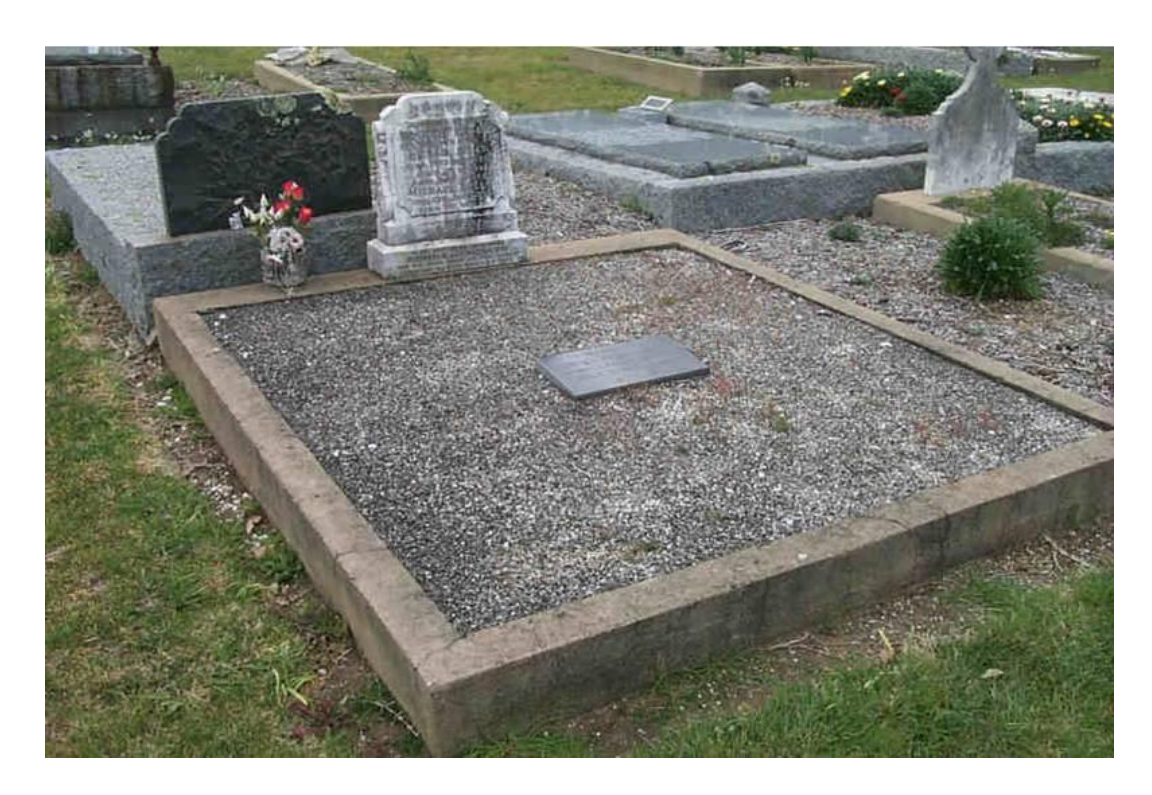
Kelly Family Grave