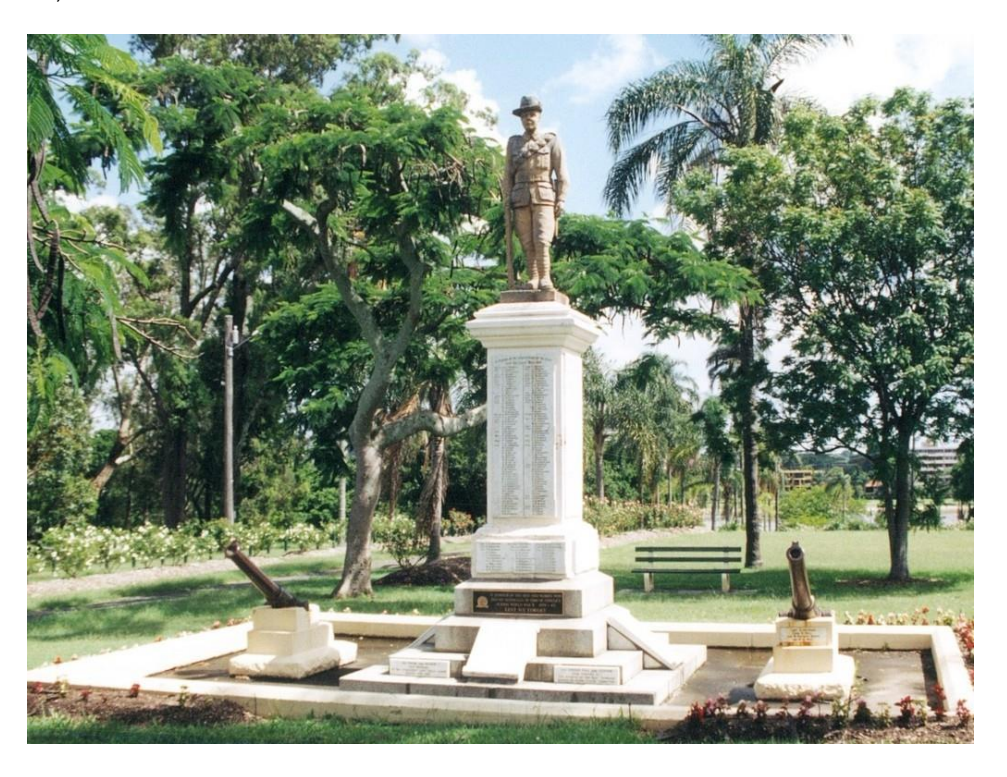
East Brisbane War Memorial