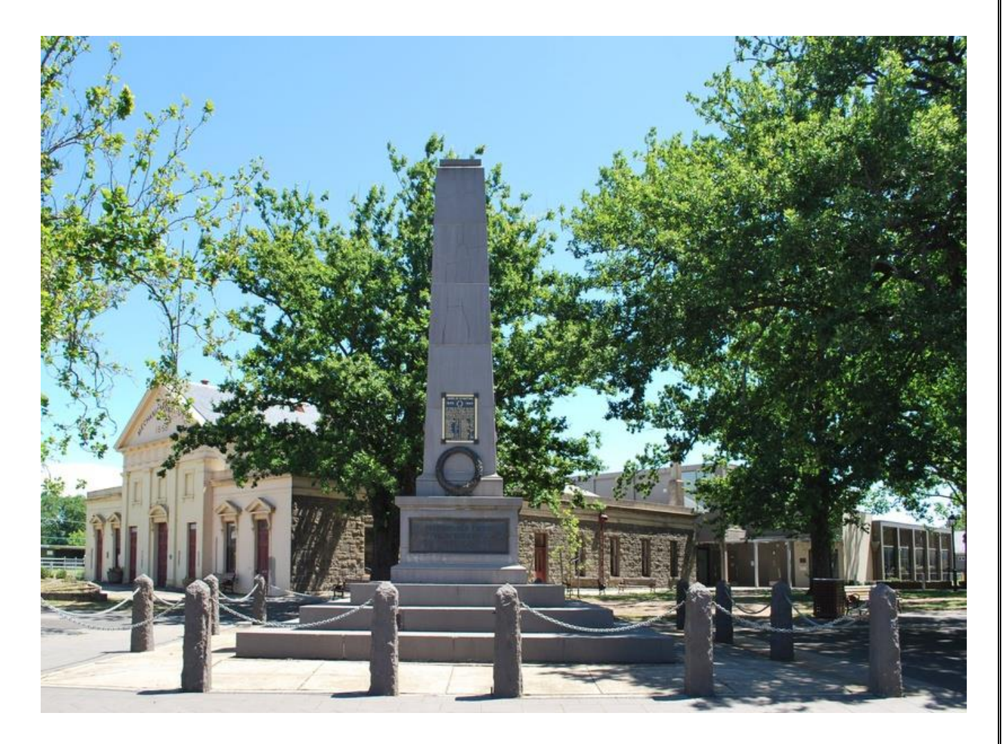
Kyneton War Memorial