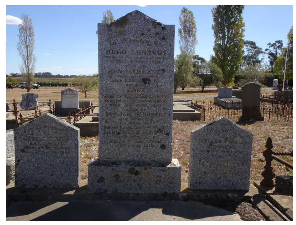
Kennedy Family Plot (Photos from Find a Grave – 44)