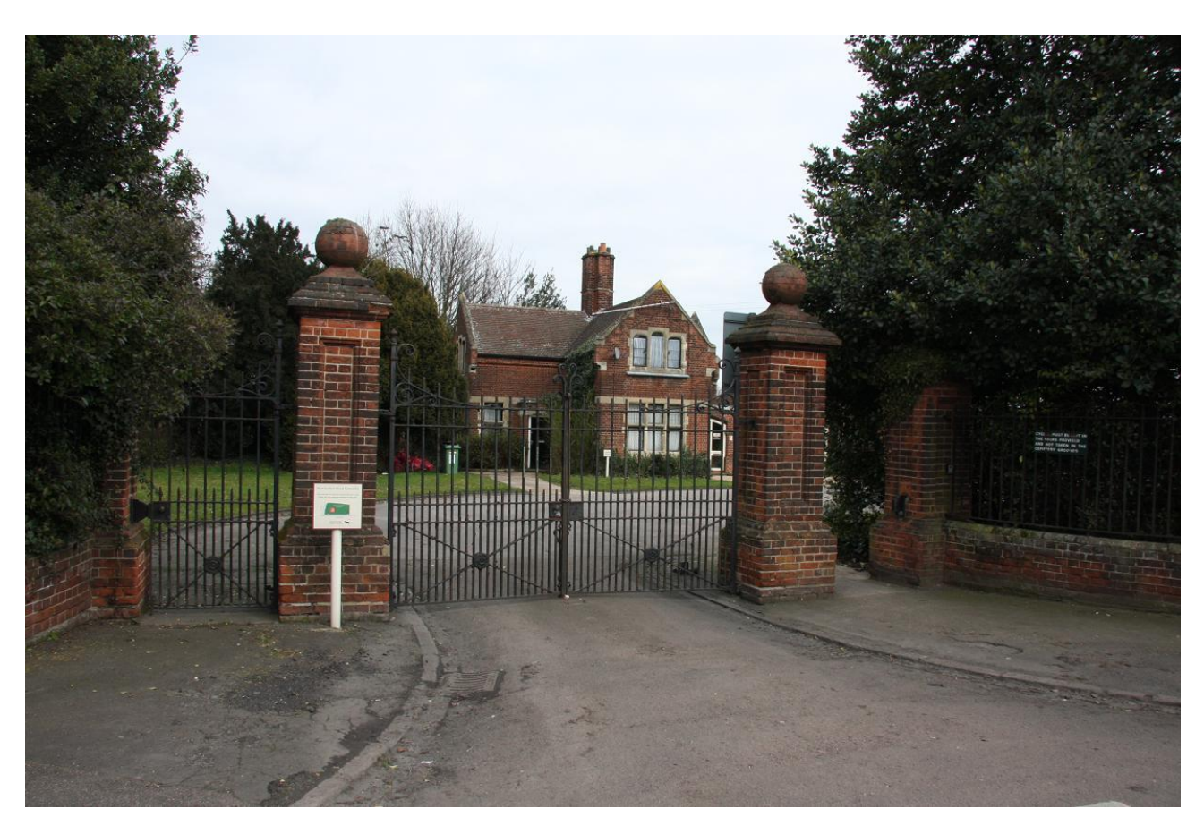
Entrance to Cambridge City Cemetery & Map (below)