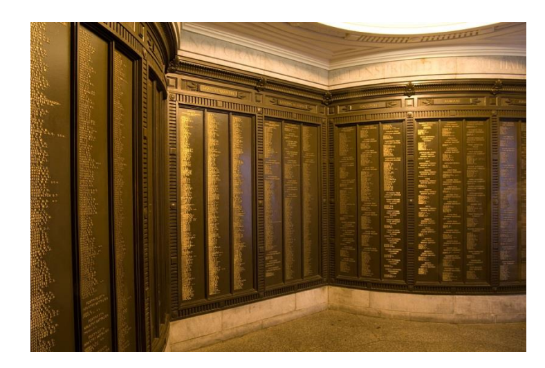
National War Memorial – Adelaide

(53 pages of Pte Ernest Kenneth's Service records are available for On Line viewing at National Archives of Australia website).